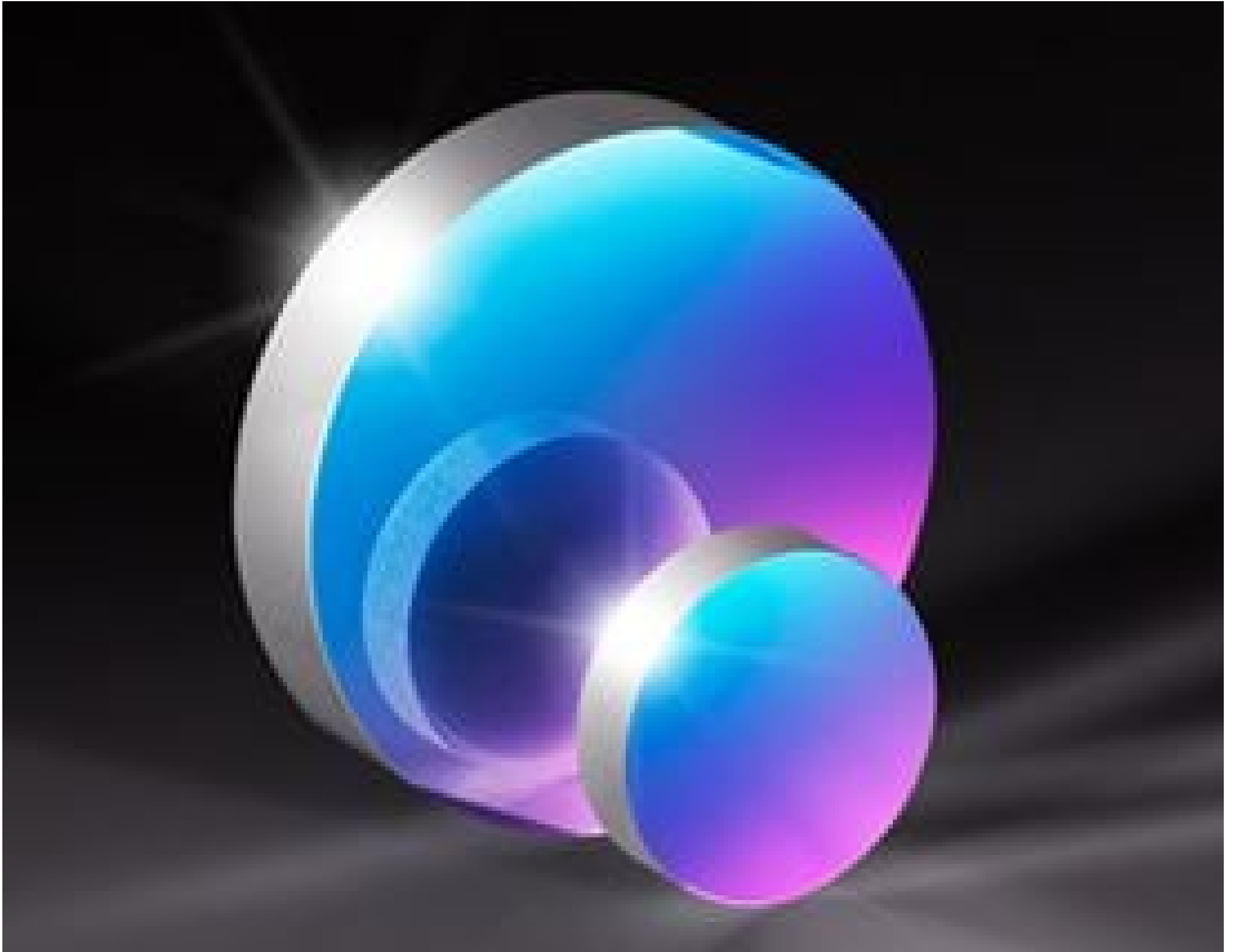
Precision Ultraviolet Mirrors