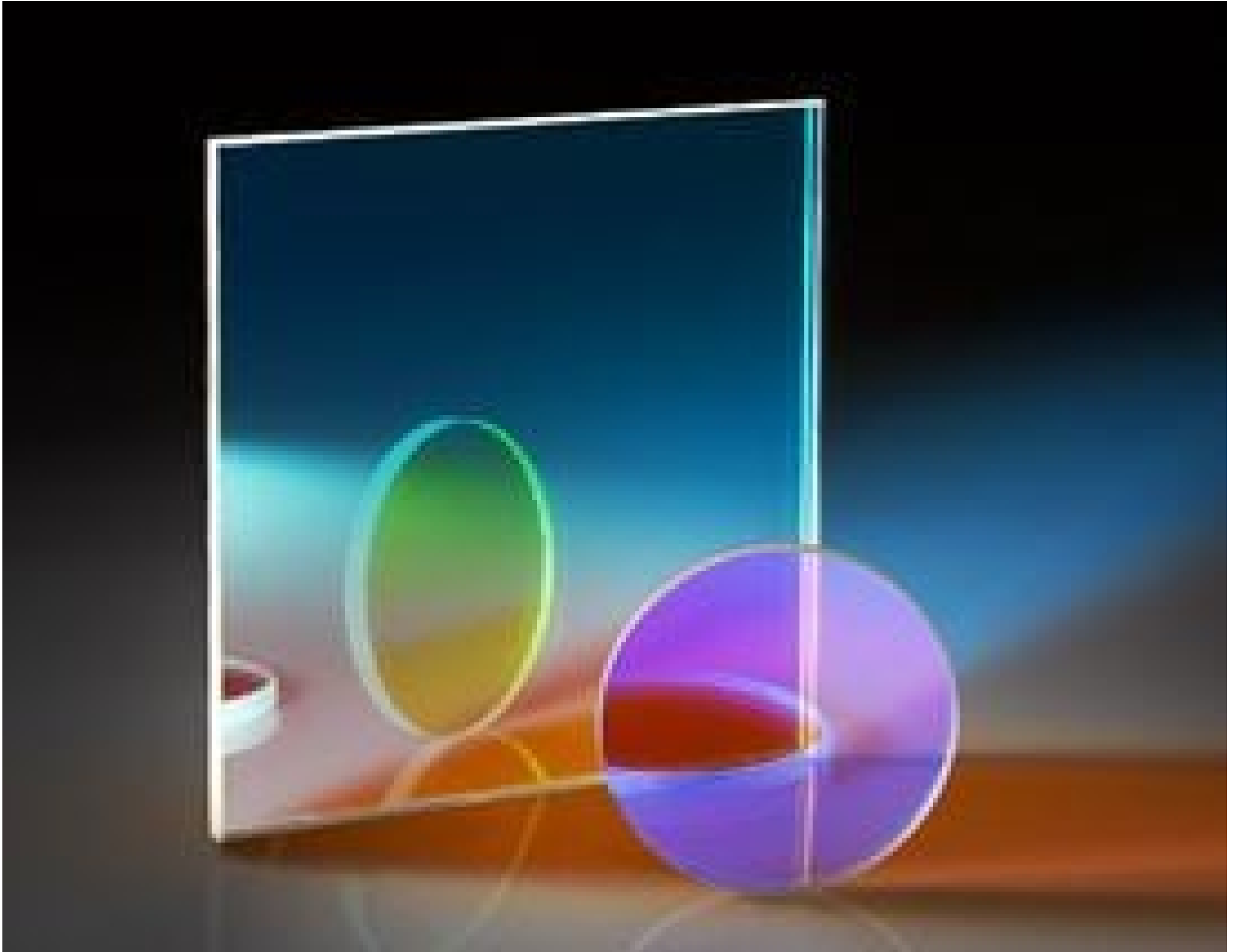
Additive and Subtractive Dichroic Color Filters