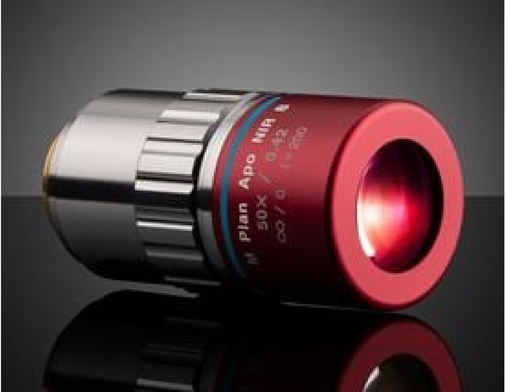
50X Mitutoyo Plan Apo NIR B Infinity Corrected Objective, #89-351