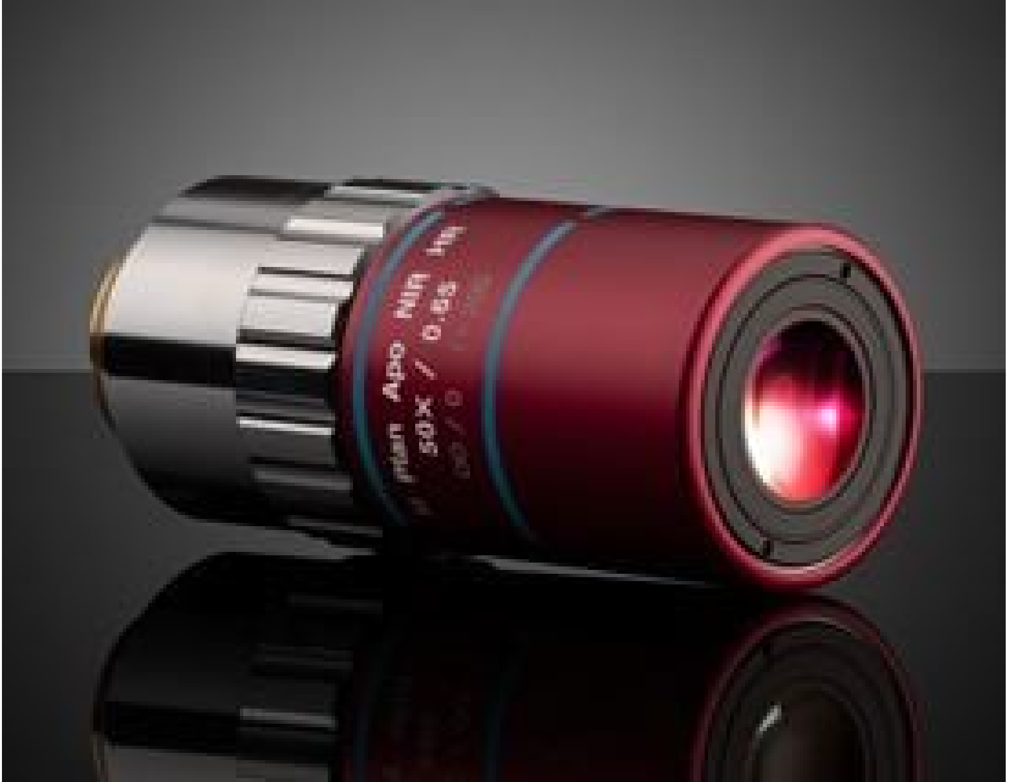
50X Mitutoyo Plan Apo NIR HR Infinity Corrected Objective, #56-982