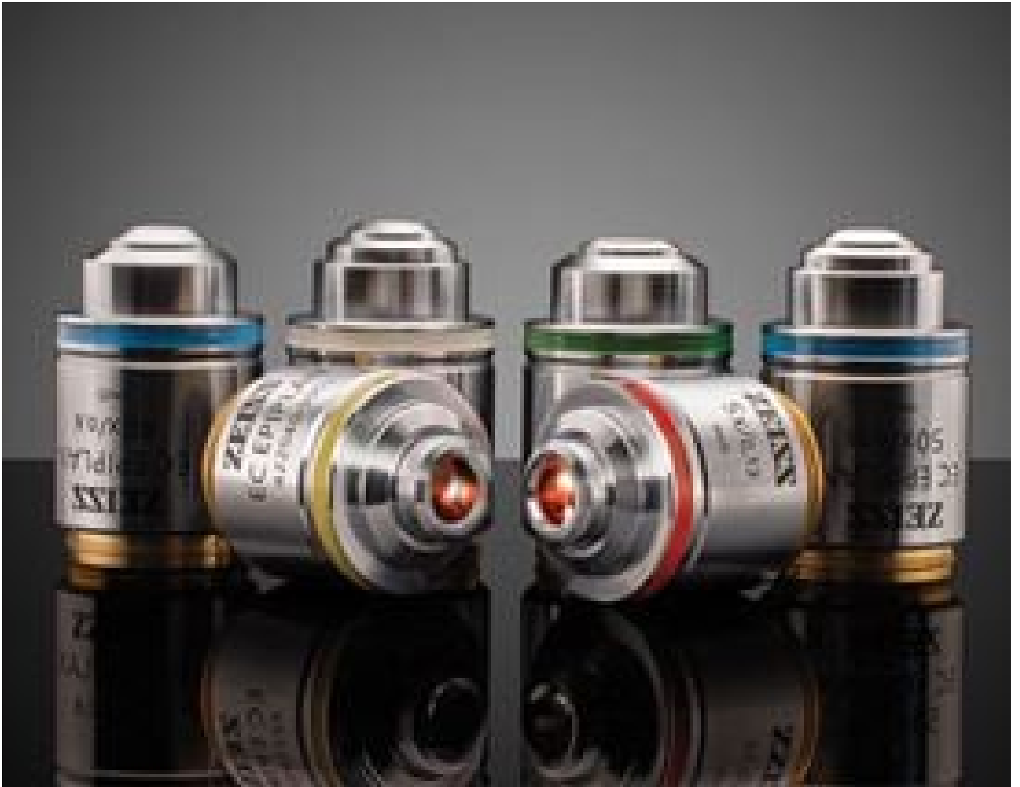
ZEISS EC Epiplan Objectives