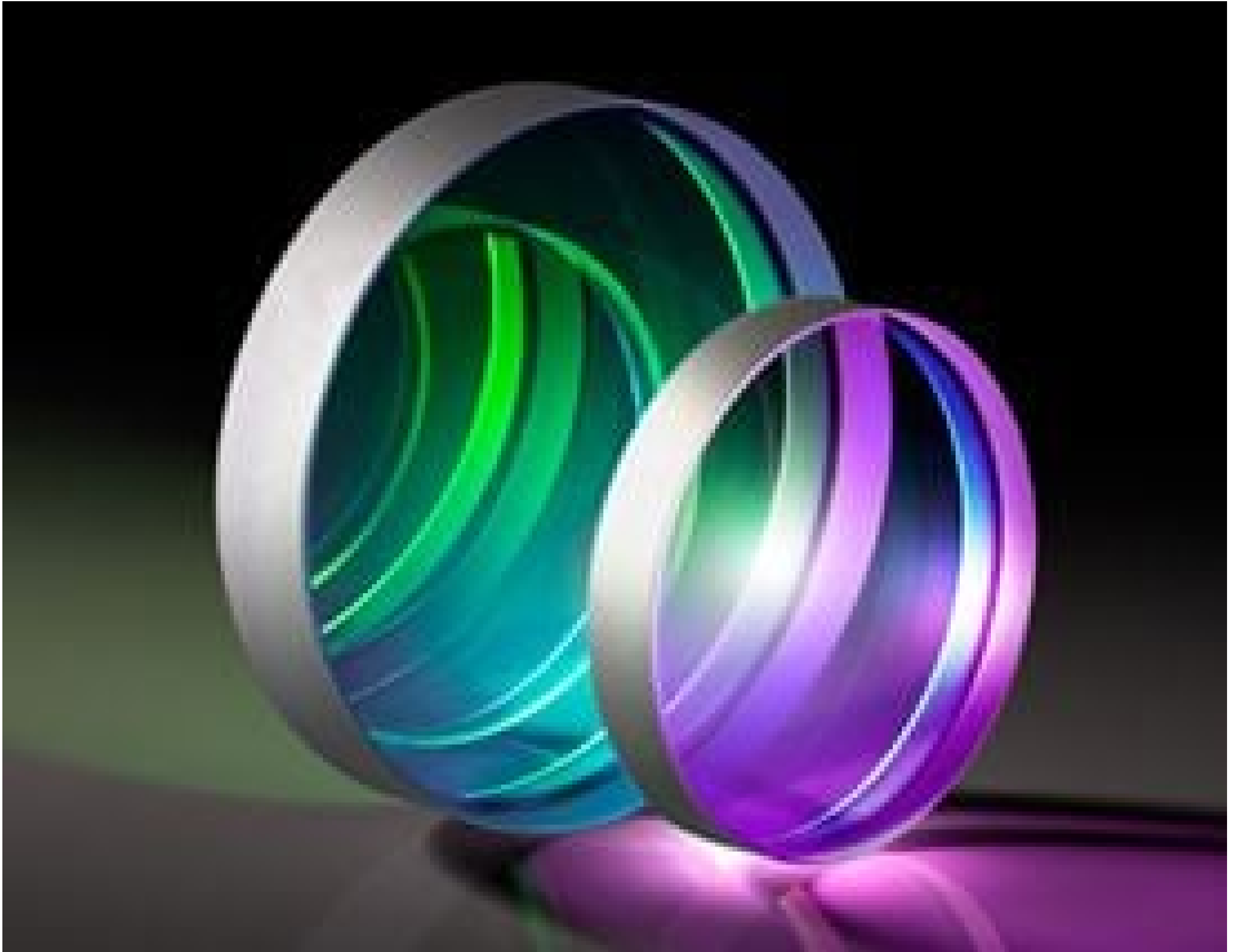
TECHSPEC® Nd:YAG Laser Output Couplers