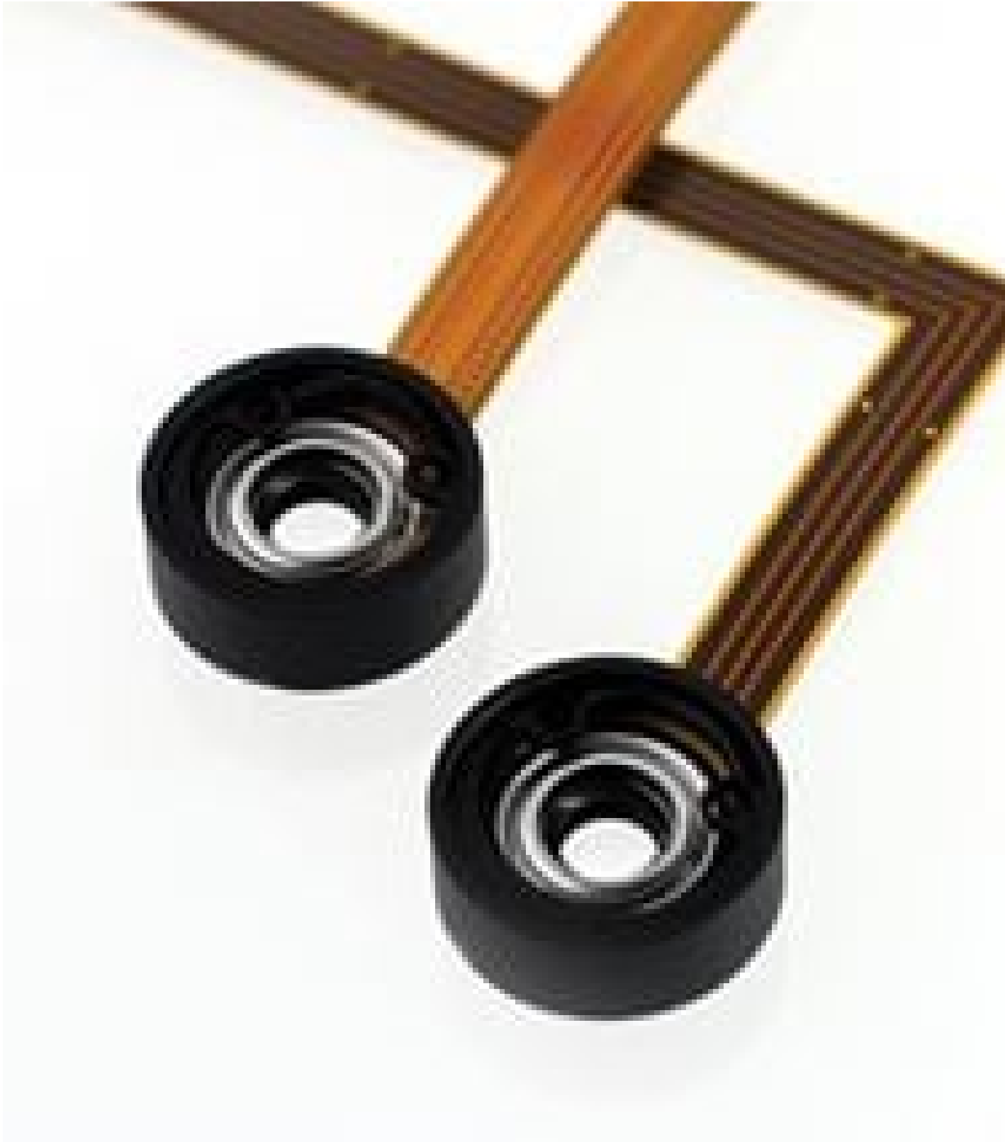
Corning® Varioptic® Variable Focus Liquid Lenses