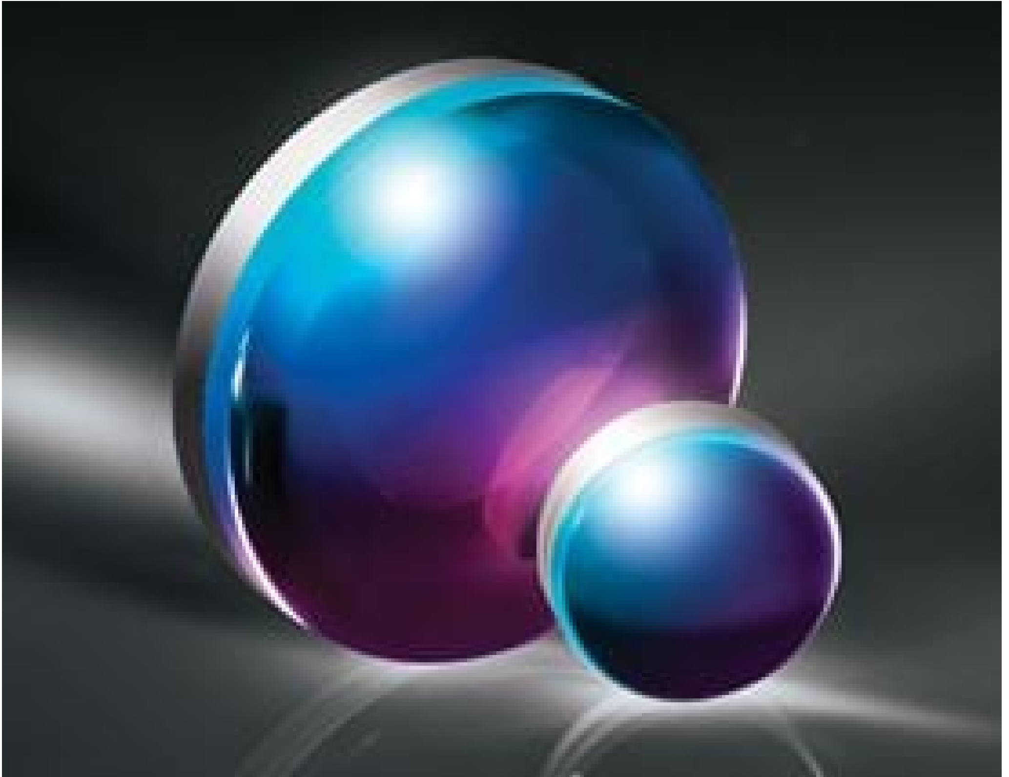
YAG-BBAR Coated Double-Convex (DCX) Lenses