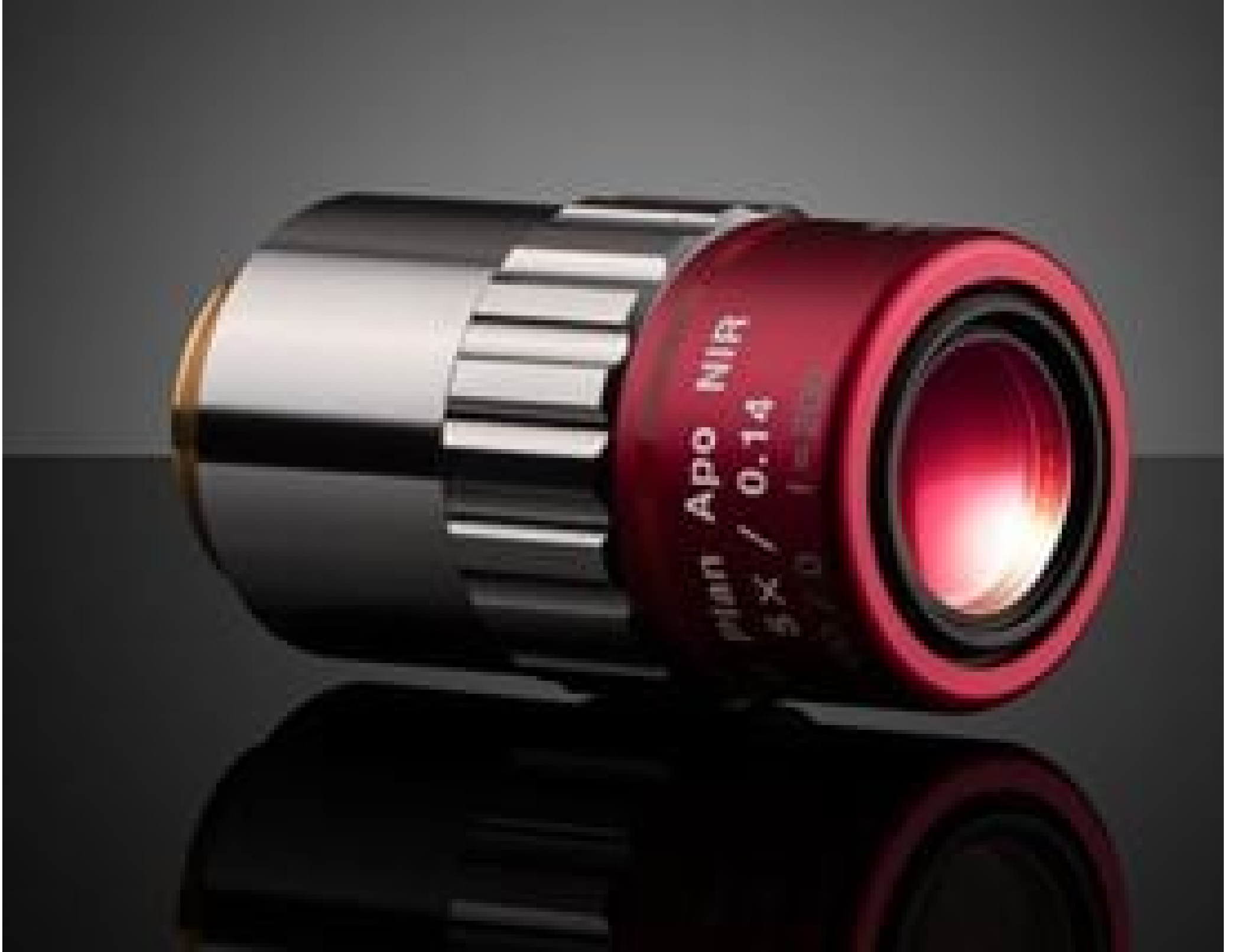
5X Mitutoyo Plan Apo NIR Infinity Corrected Objective, #46-402