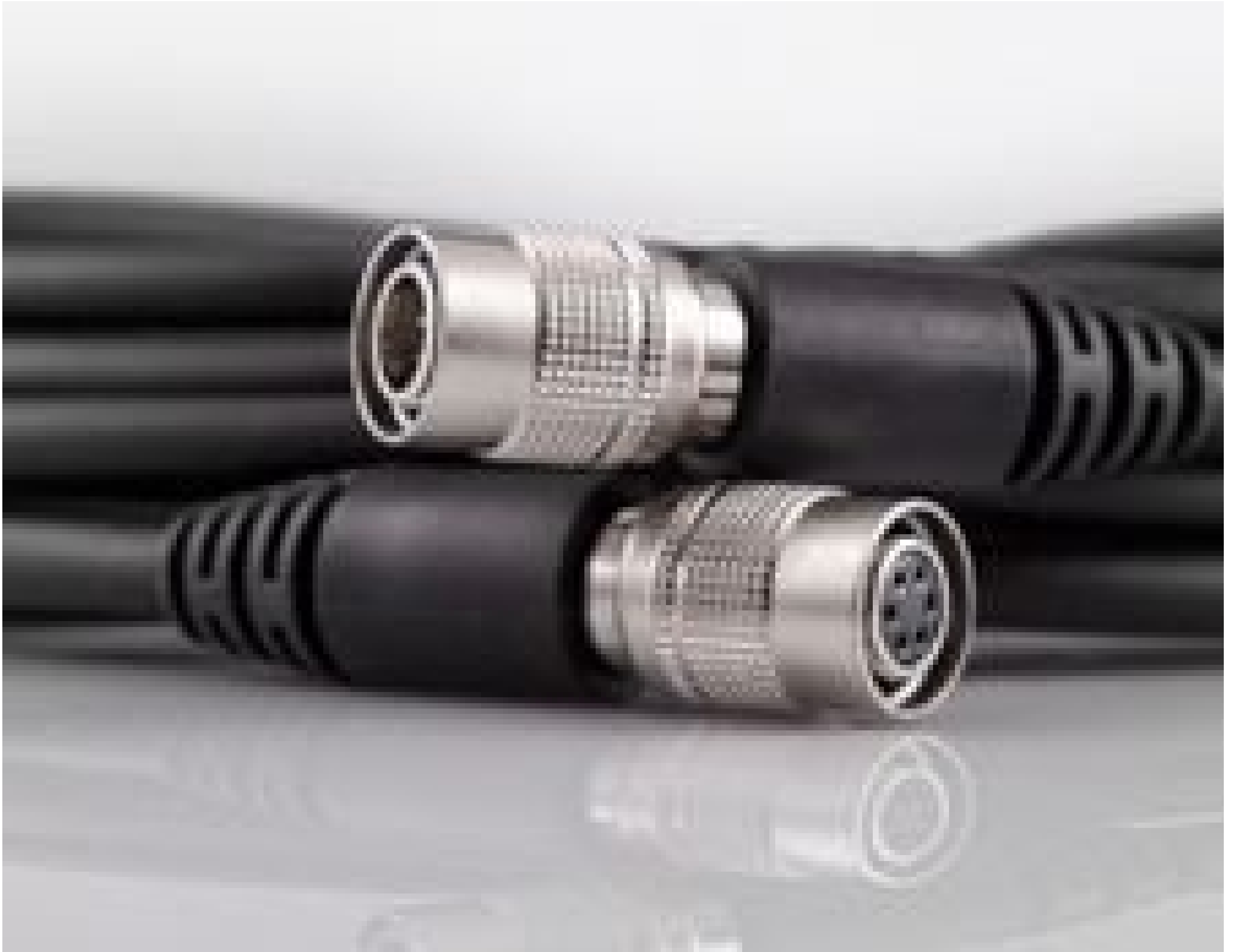
6-way Hirose Male/Female Cable