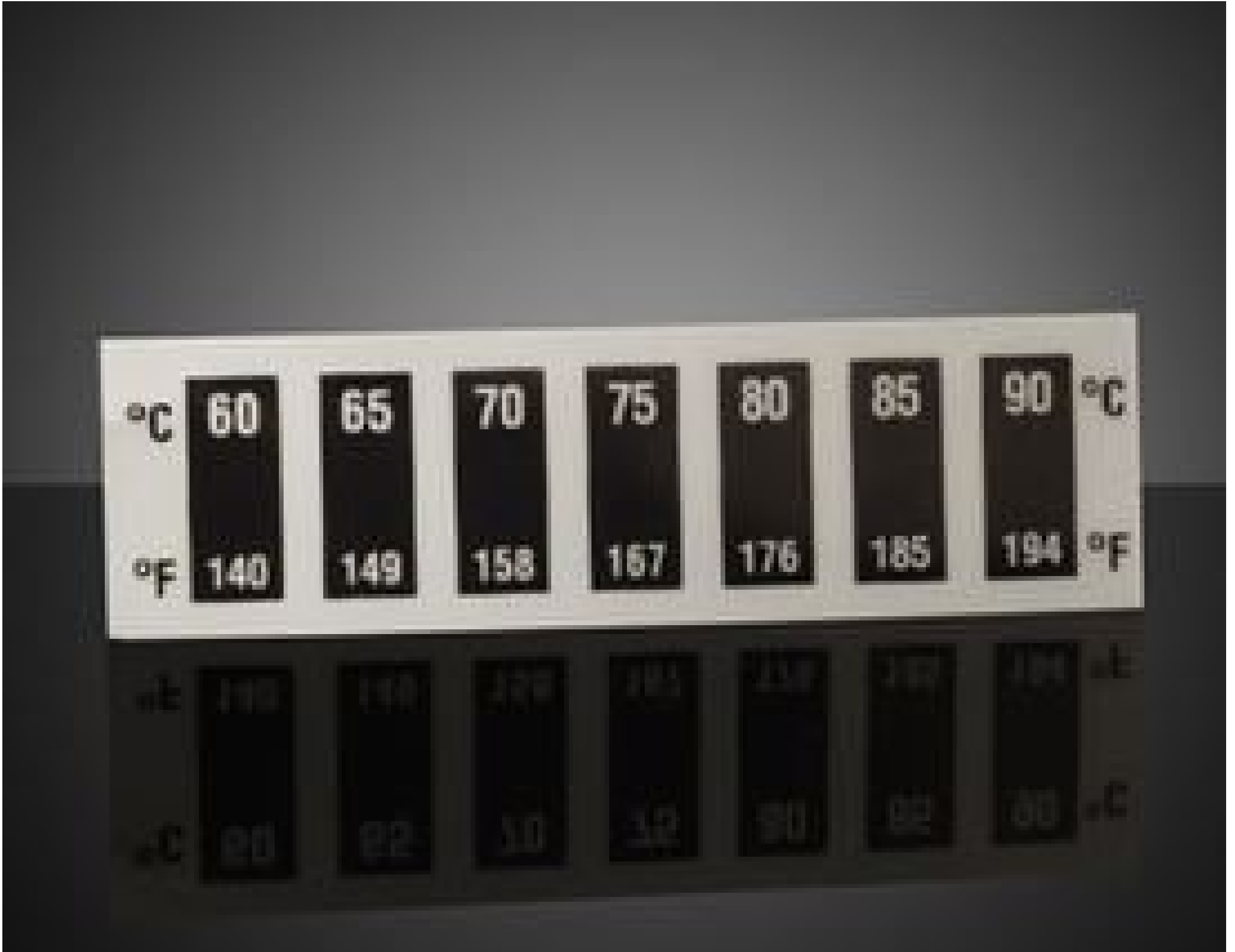
60 - 90°C Temp Range, Liquid Crystal Thermometers (10/Pack)