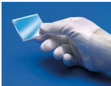
Component Handling Tools

These optics require special handling to avoid damage and ensure long-term performance. Proper handling, cleaning, and storage are essential to maintain optical quality. Explore our Optics Cleaning Resources for step-by-step guides and best practices. For personalized assistance, Email us or Chat with our technical support team.