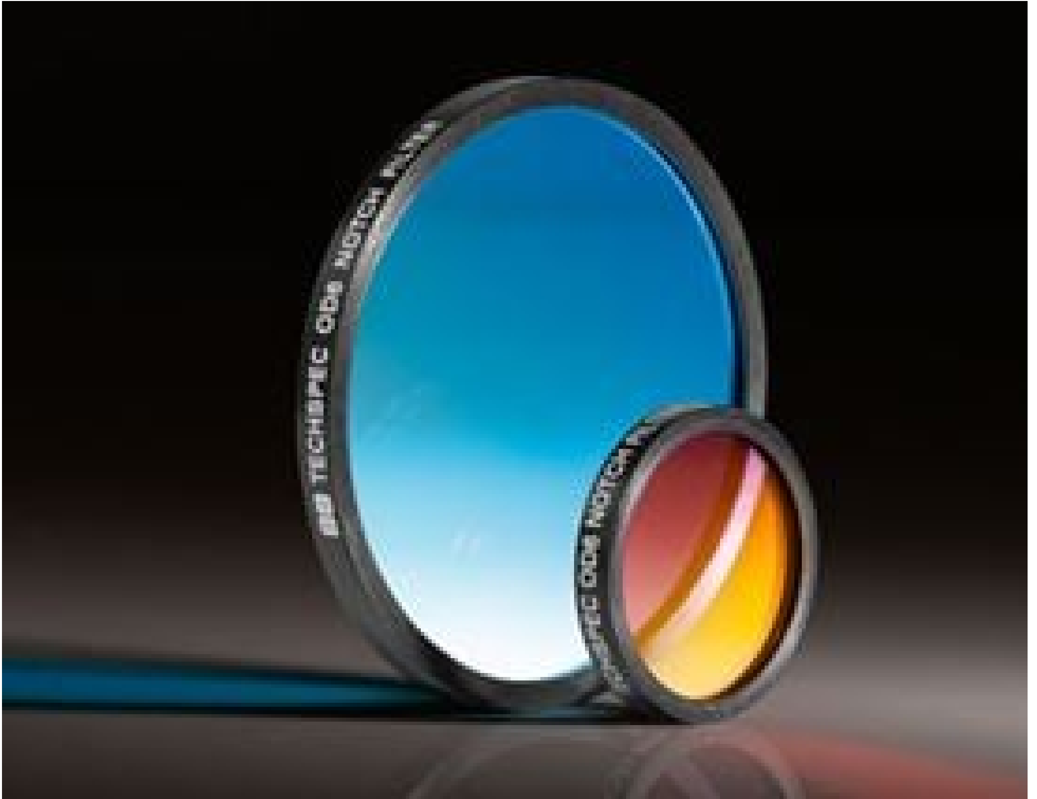
TECHSPEC OD 6.0 Notch Filters