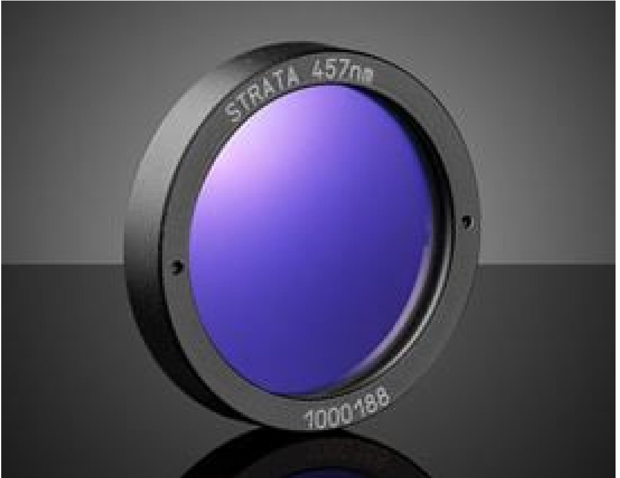
25.4mm META® holoOPTIX® STRATA Notch Filter