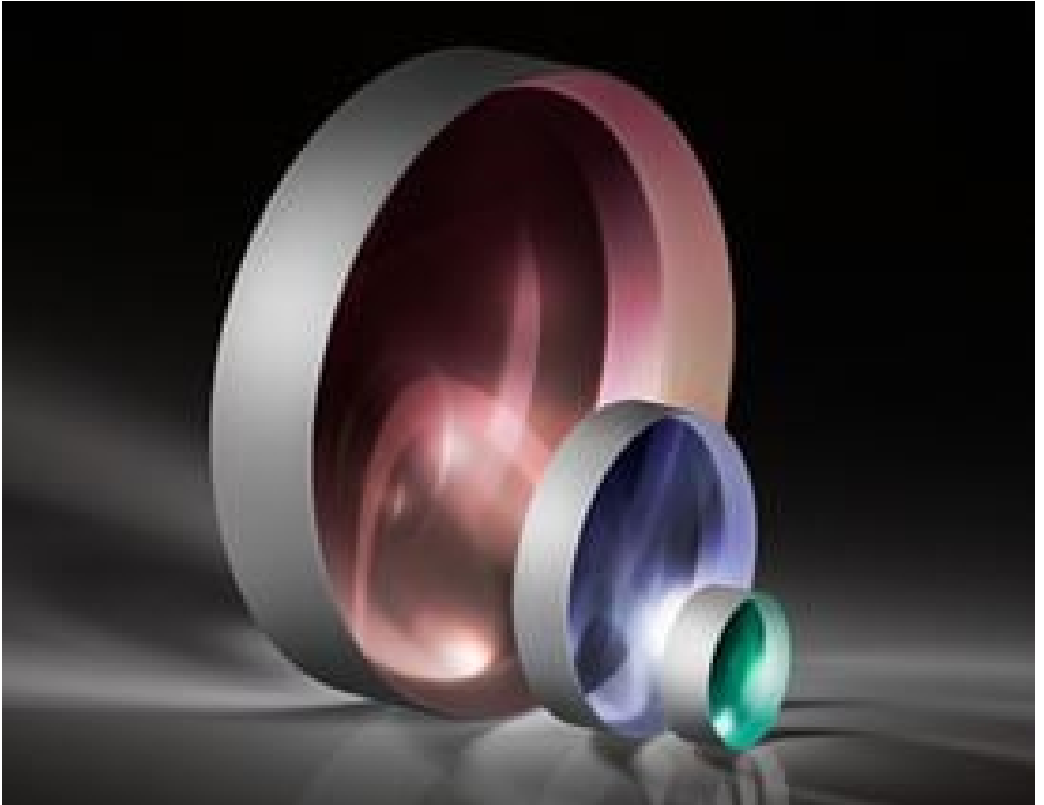
TECHSPEC VIS-NIR Coated Plano-Concave (PCV) Lenses