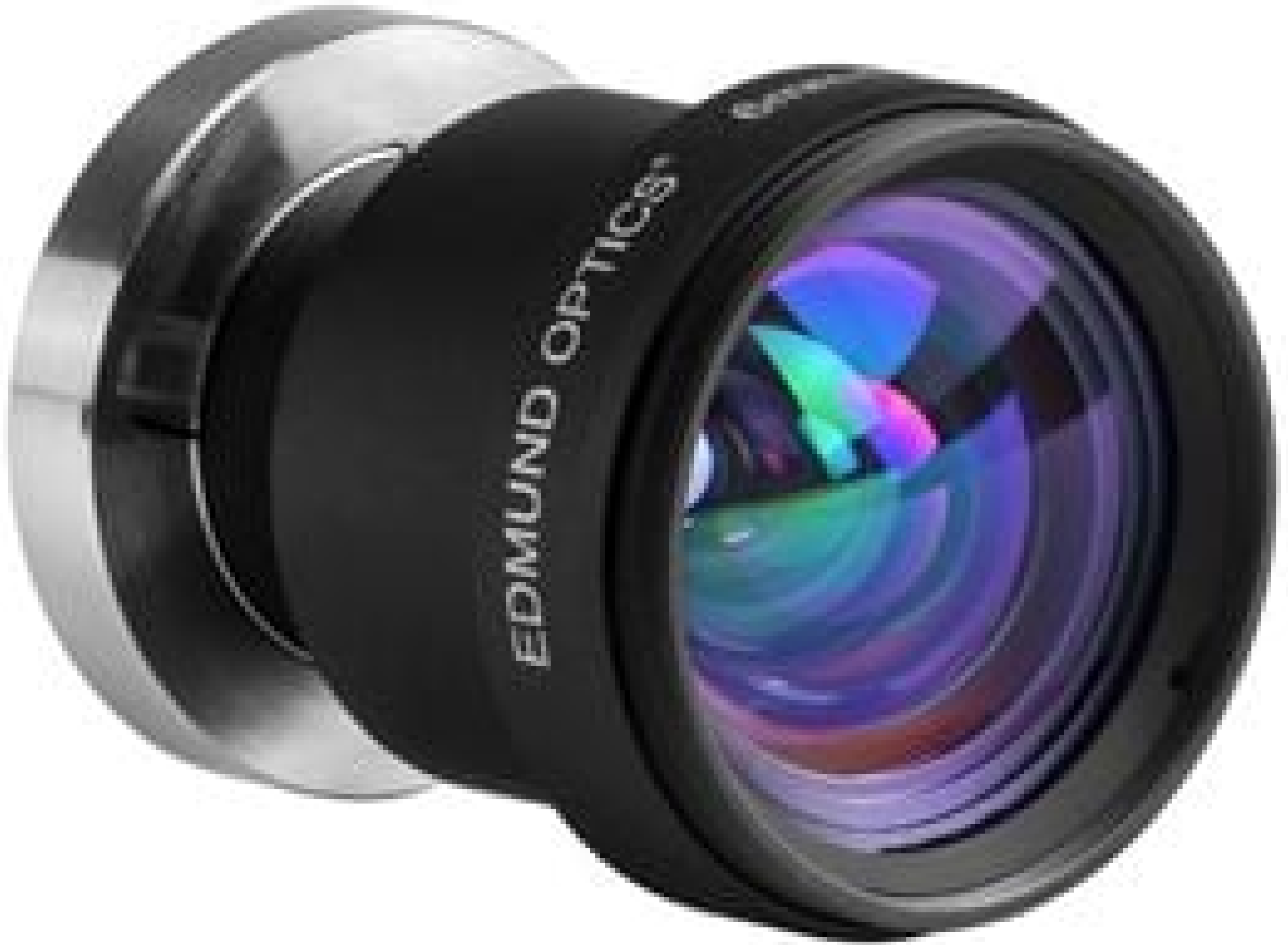
6mm Cr Series Fixed Focal Length Lens