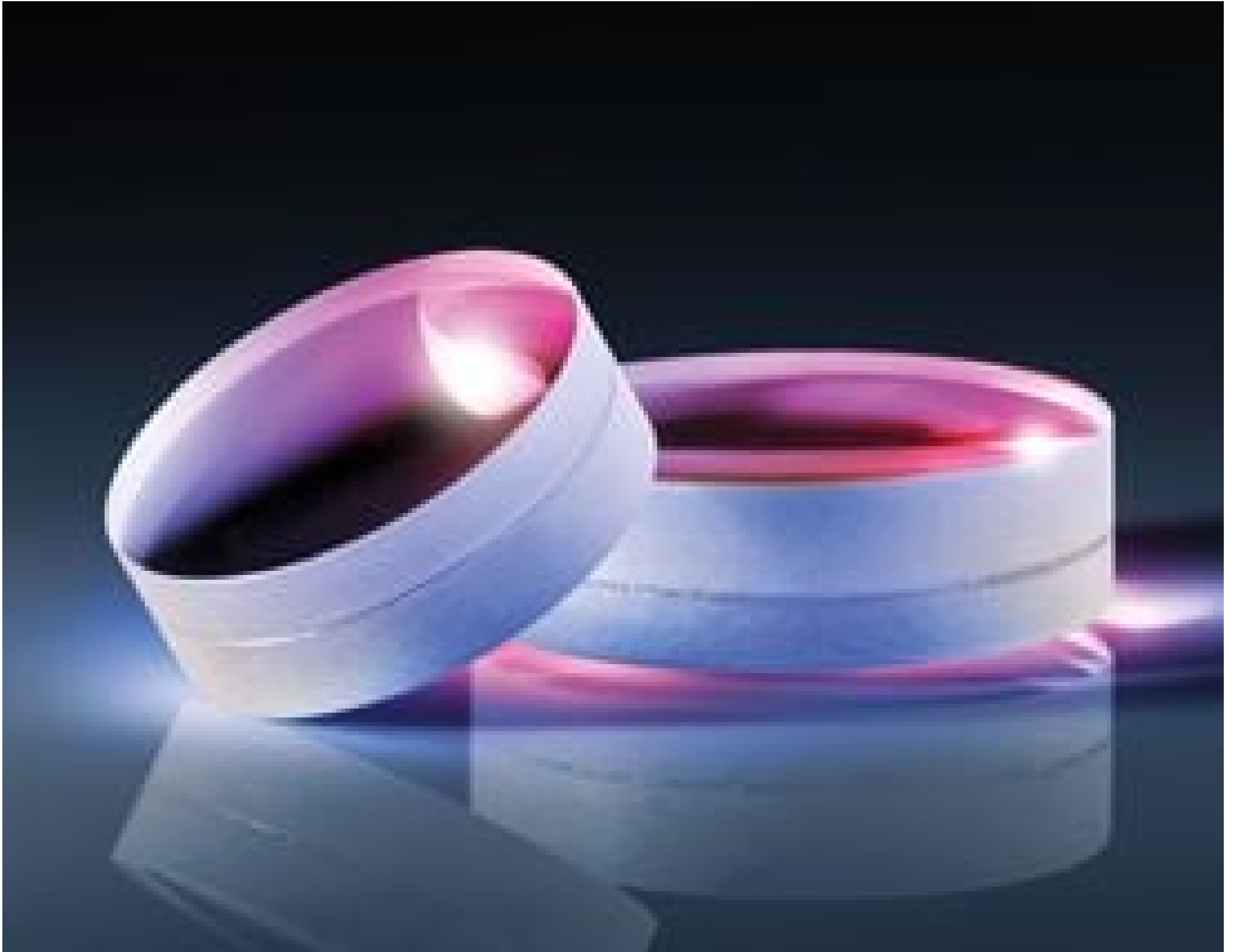
MgF 2 Coated Achromatic Lenses