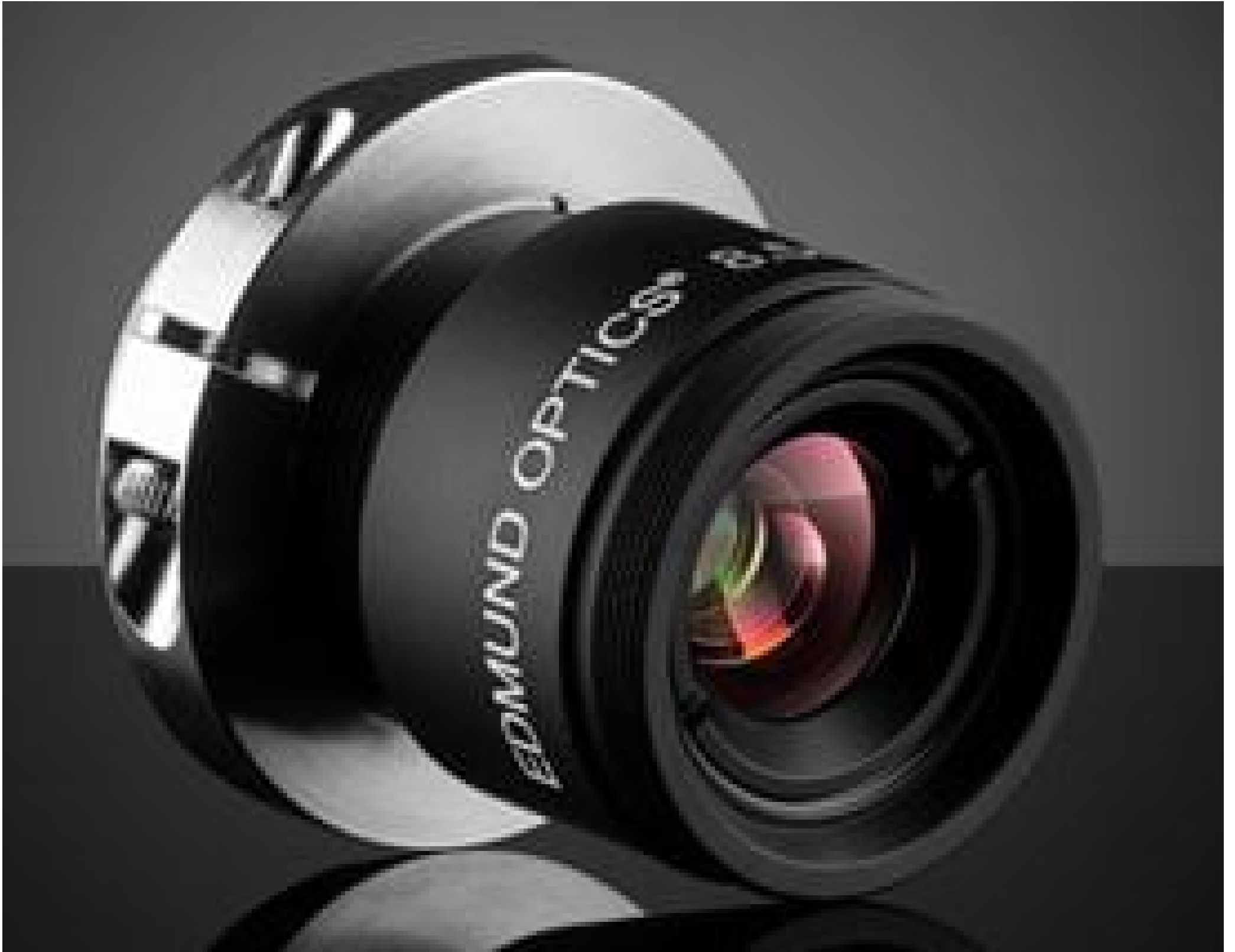
8.5mm Cr Series Fixed Focal Length Lens