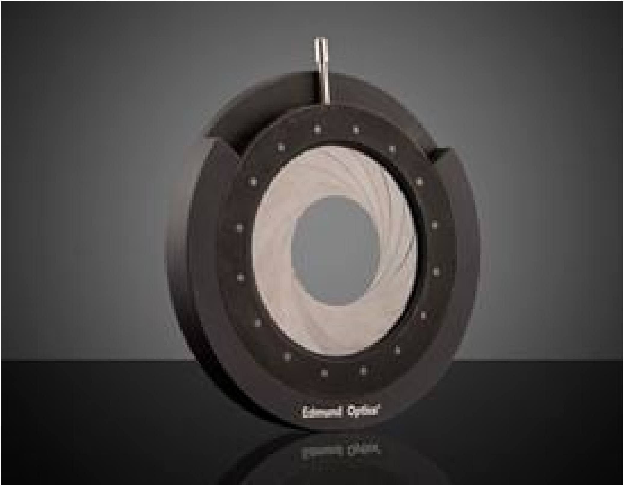
86mm Outer Diameter, Mounted Iris Diaphragm, #53-917