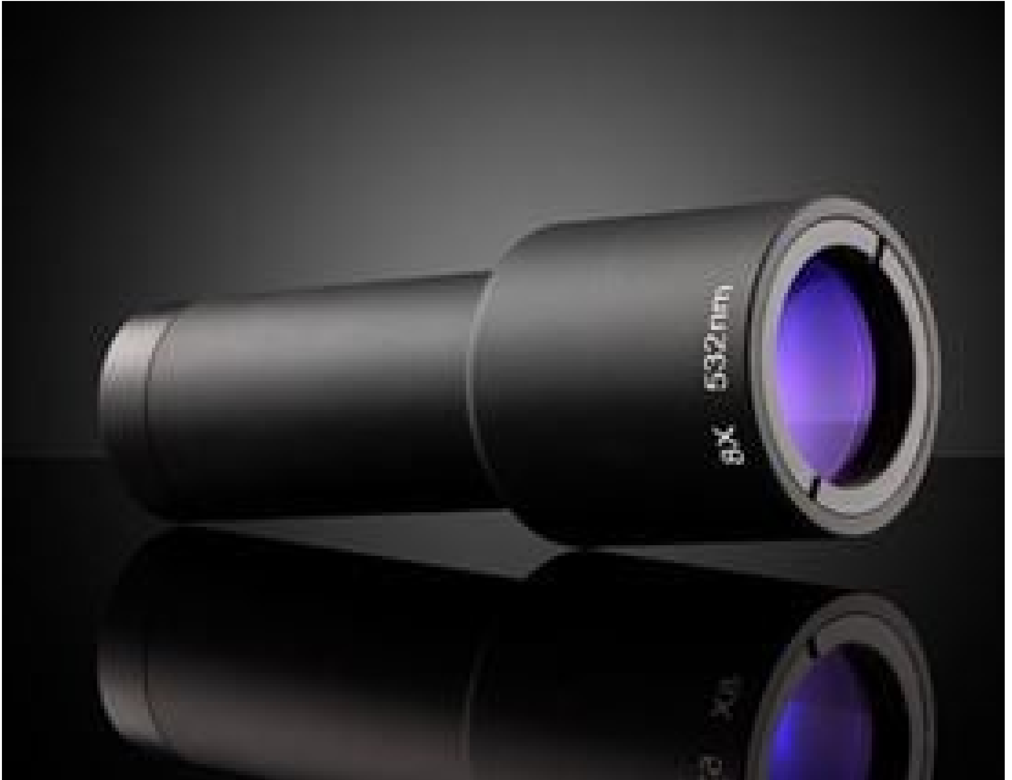
8X, 532nm LChT Fixed YAG Beam Expander, #37-065