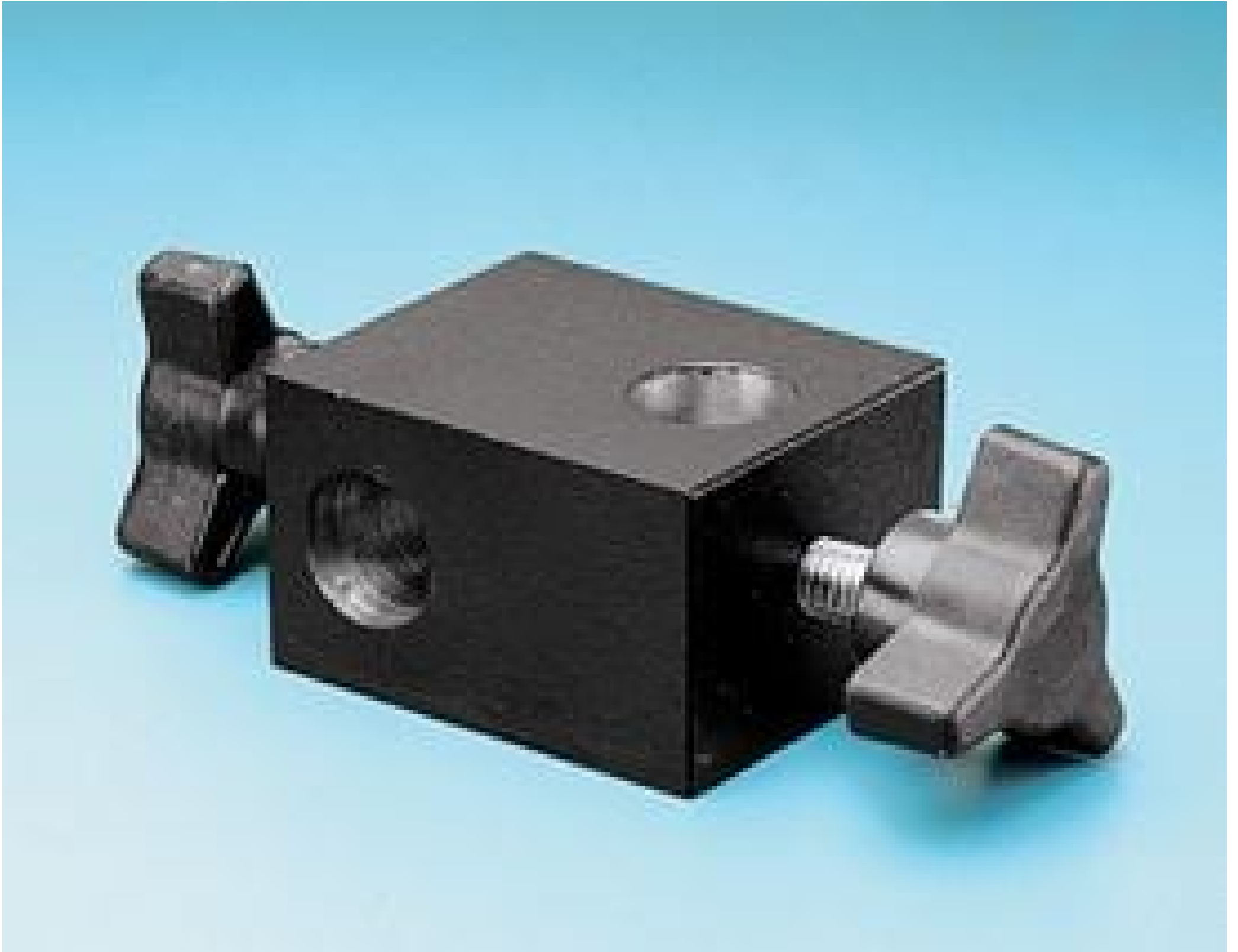
#39-355 90° Angle Mount