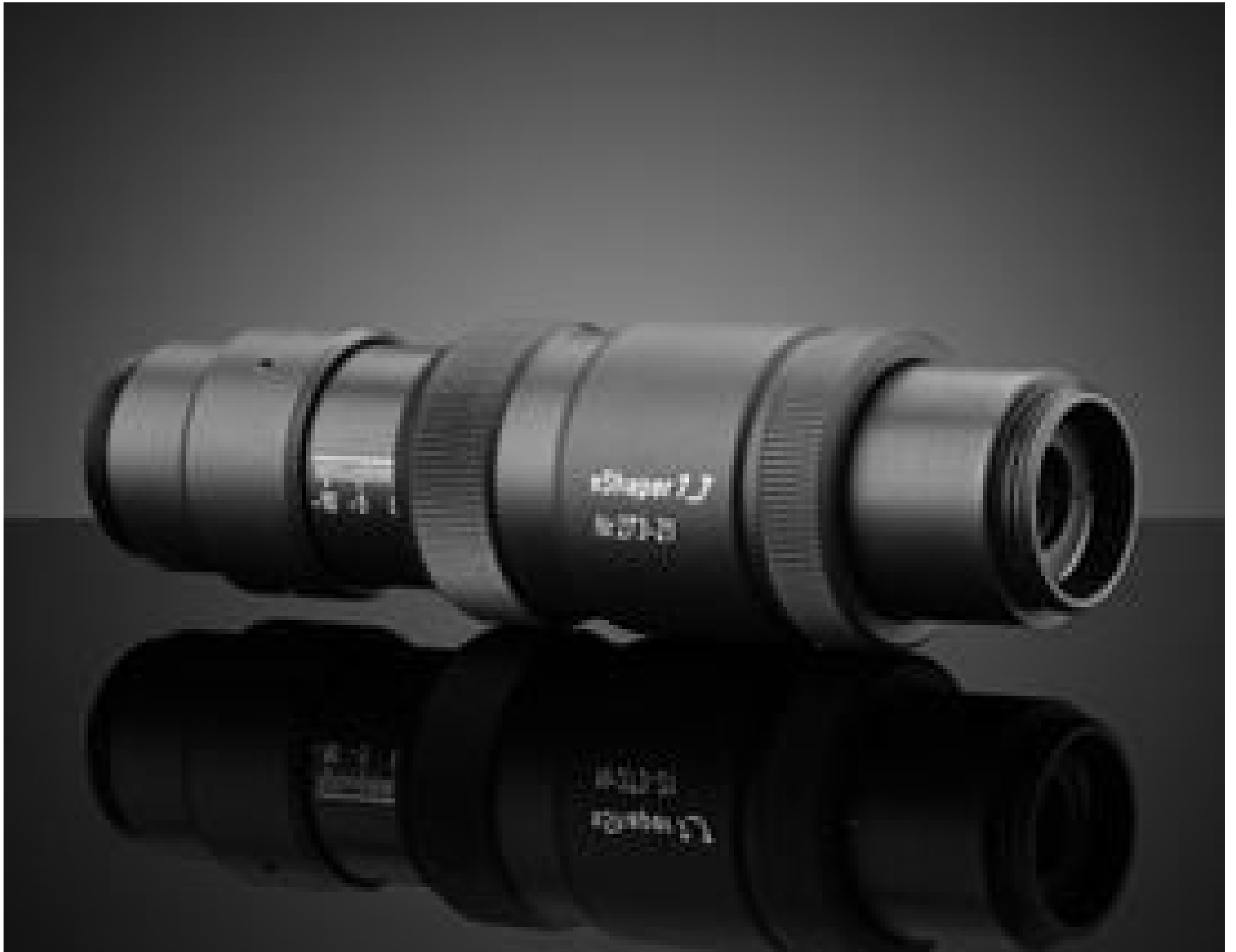
#25-838: 9.4µm Flat Top Beam Shaper | πShaper 7_7_9.4