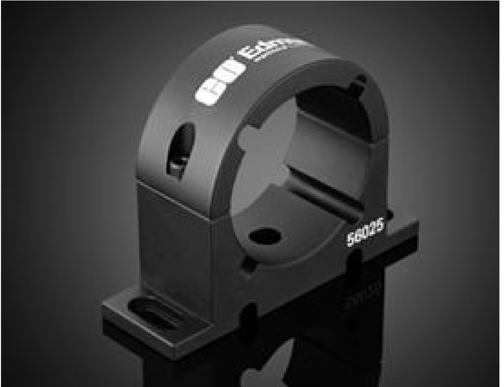
#56-025: Mounting Clamp, 65mm Inner Diameter