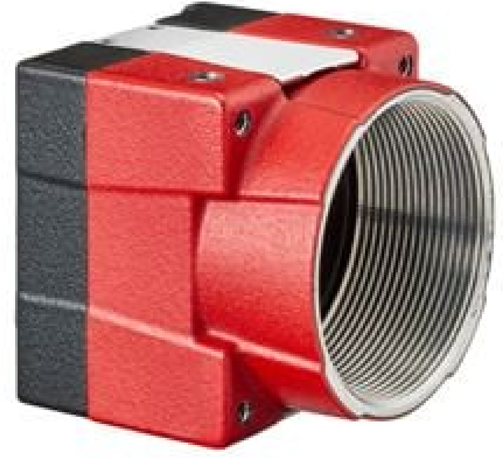
Allied Vision Alvium Camera, Full Housing (Front)