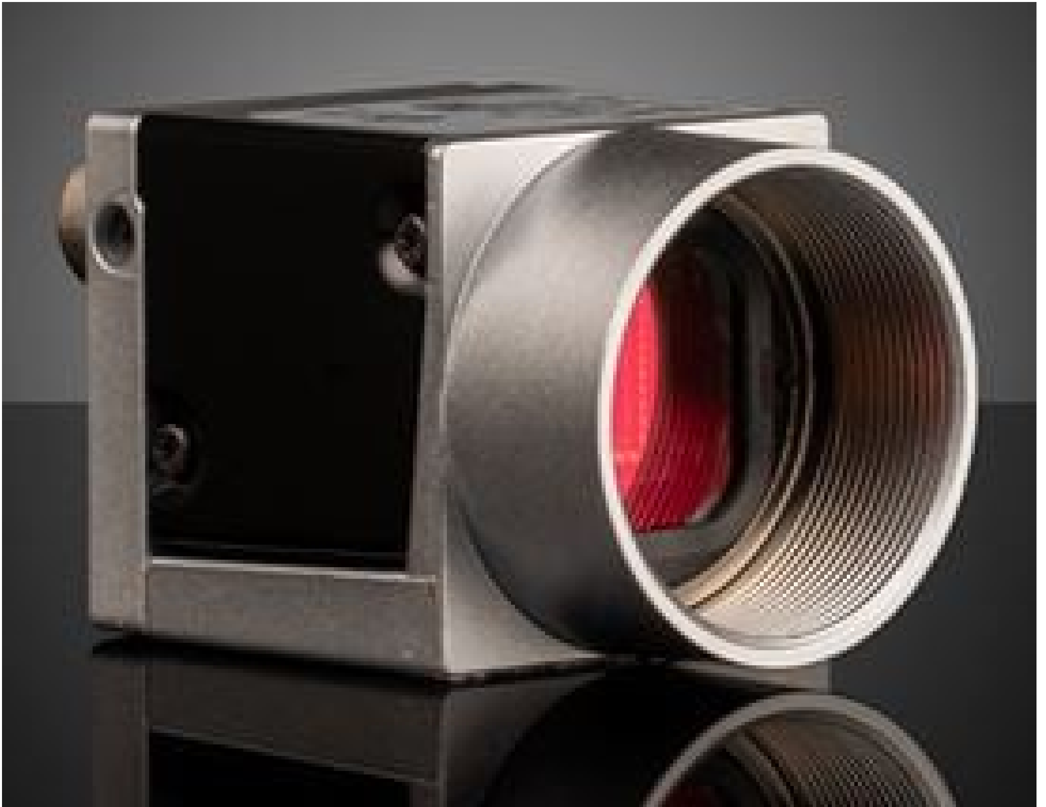
Basler ace USB 3.0 Cameras (Front)