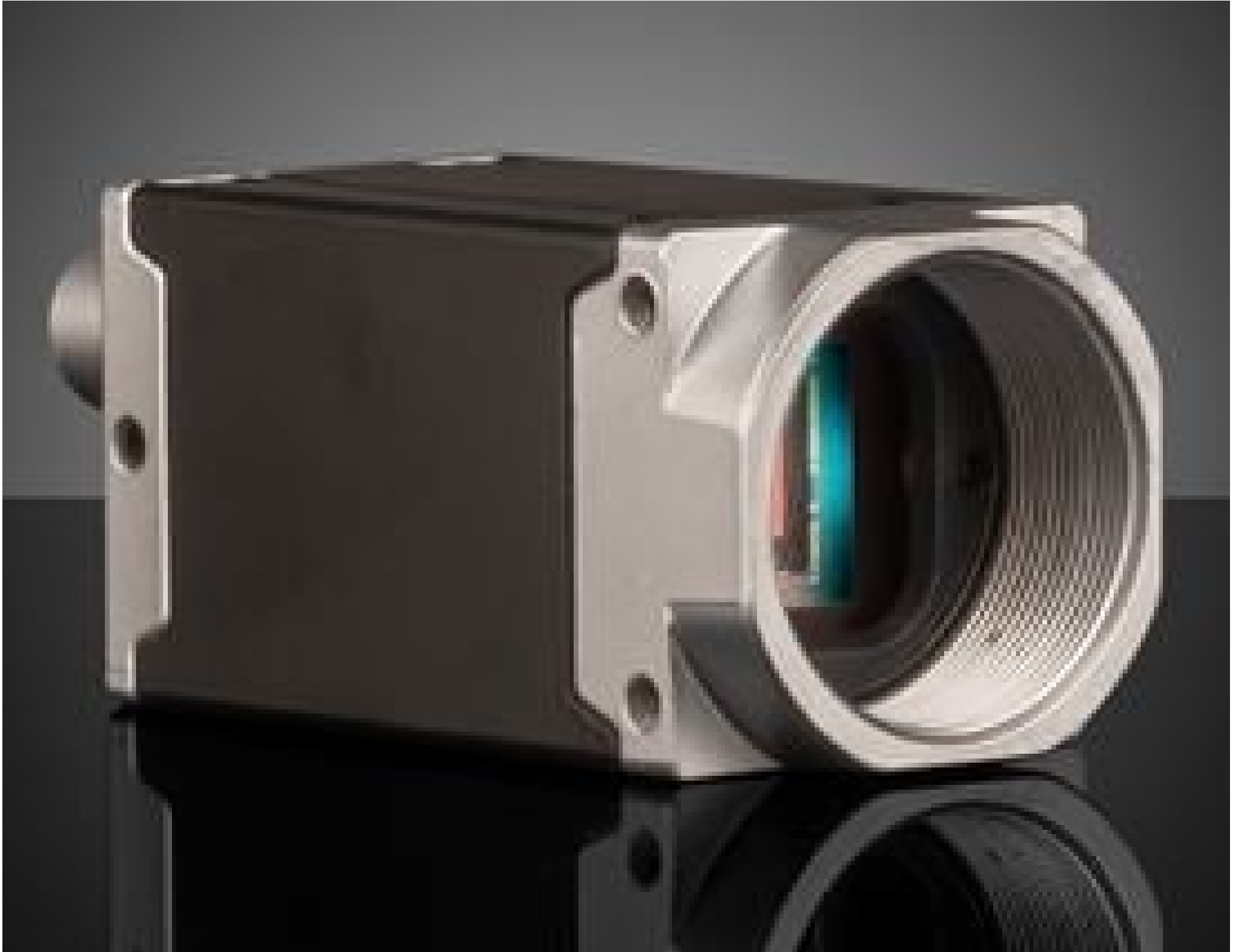
Basler ace2 GigE Cameras (Front)