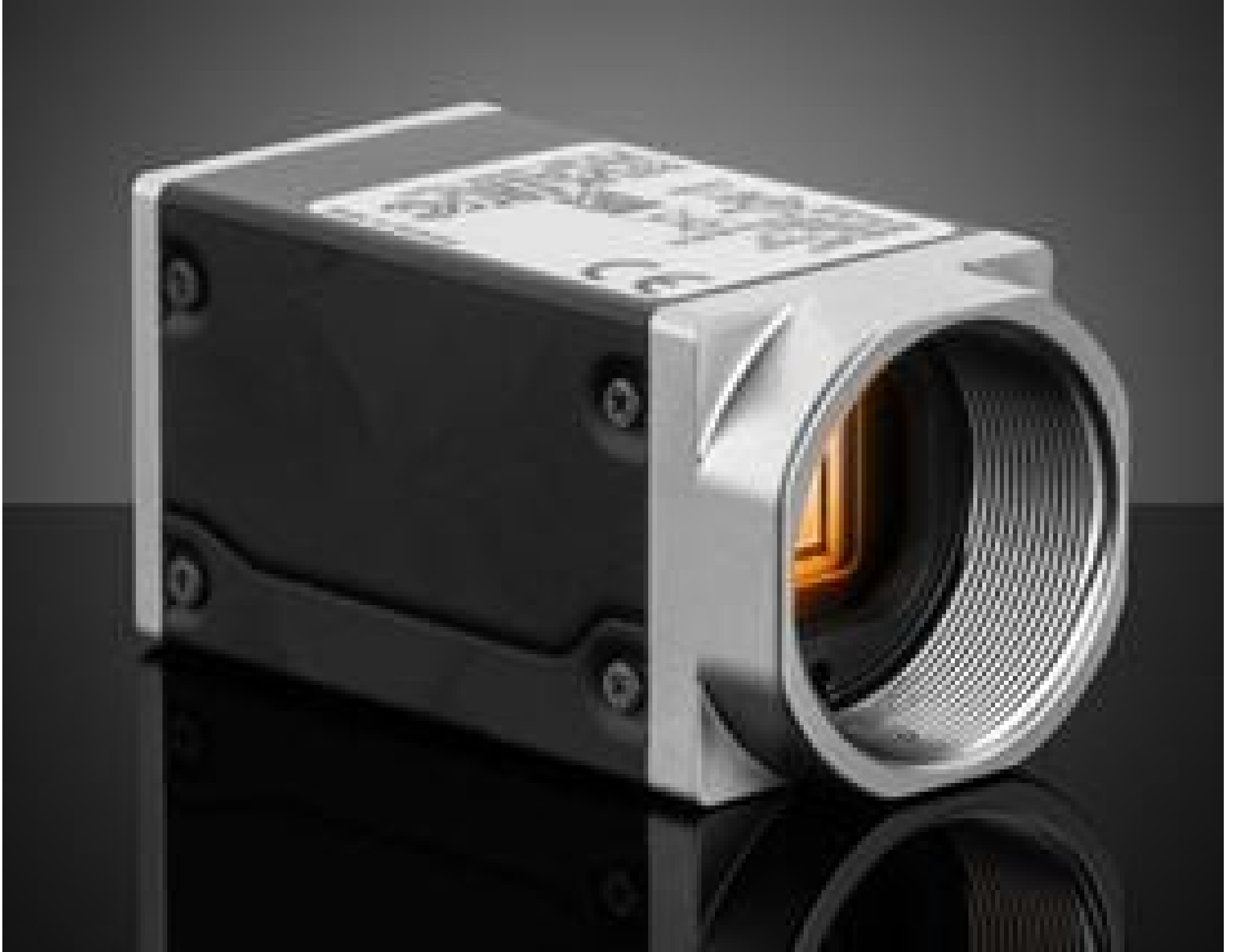
Basler ace2 Ultraviolet (UV) GigE Camera