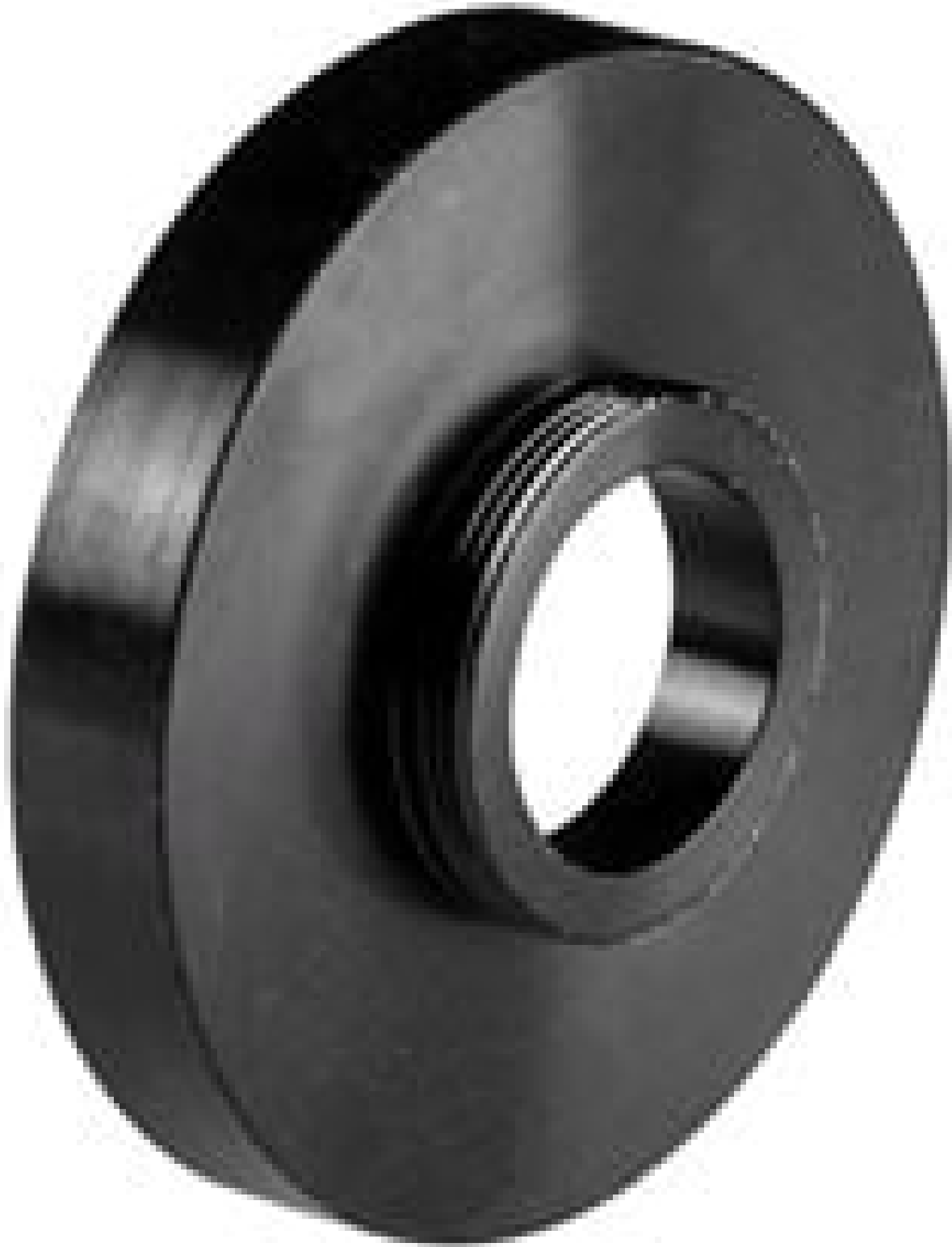
C-Mount Accessory Mount for #47-274, #56-869