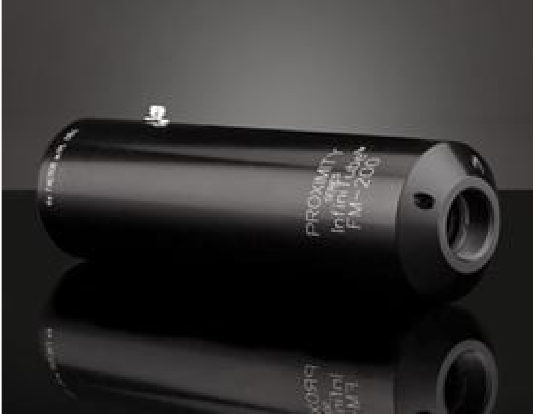
InfiniTube FM-200 (1X), #58-310

See More by Infinity Photo-Optical Company