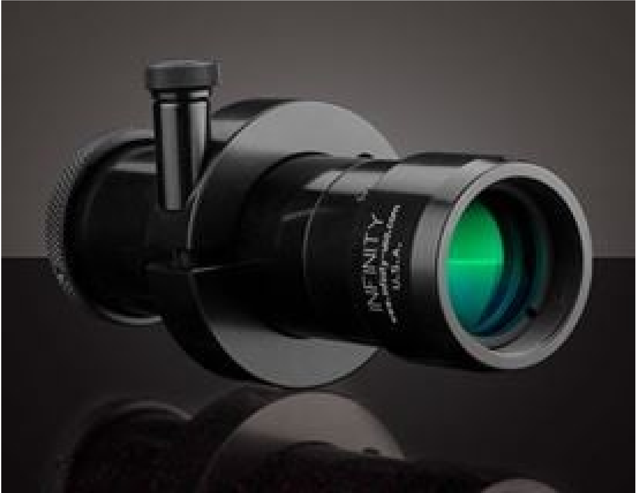
Standard (with no In-Line Attachment), InfiTube, #56-125

See More by Infinity Photo-Optical Company