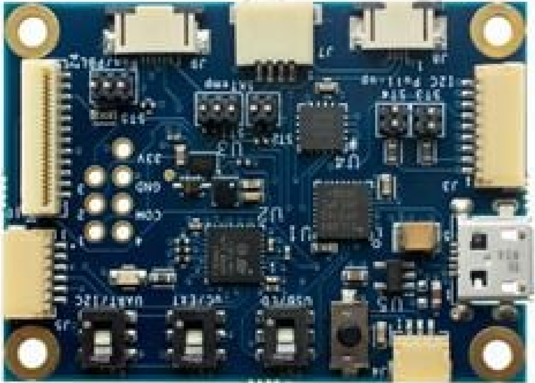
USB-MUniversal Driver Board