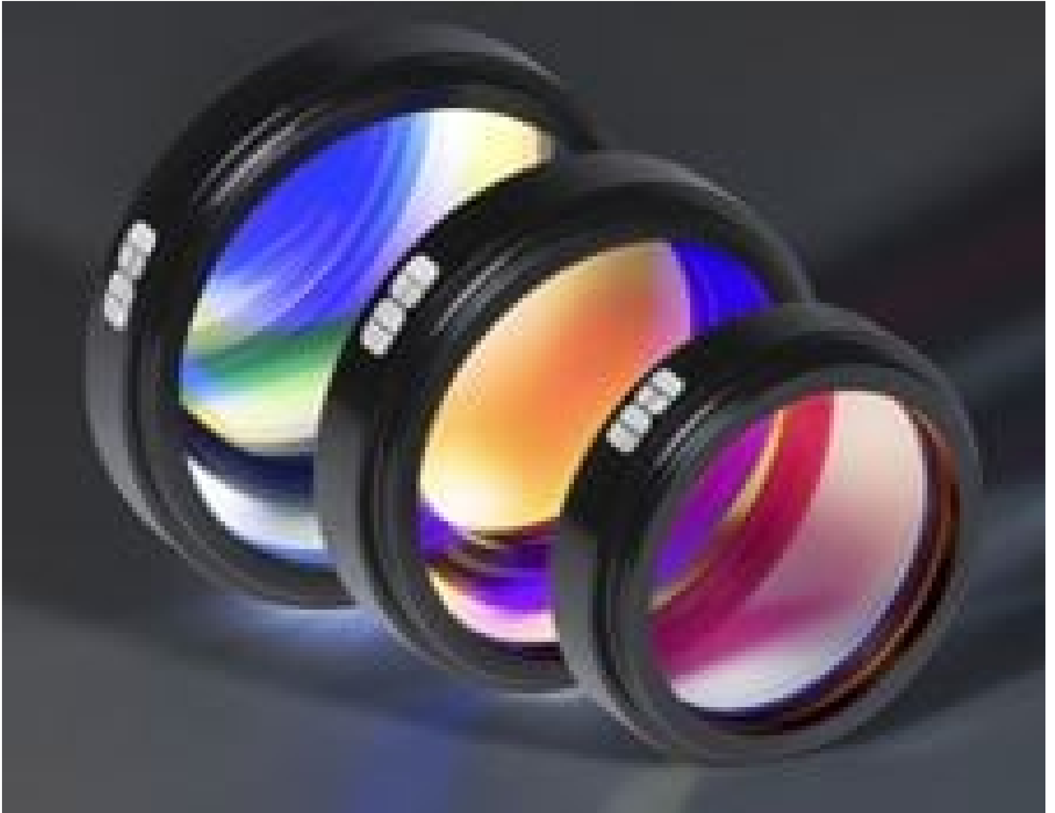
TECHSPEC® High Performance Mounted Machine Vision Filters