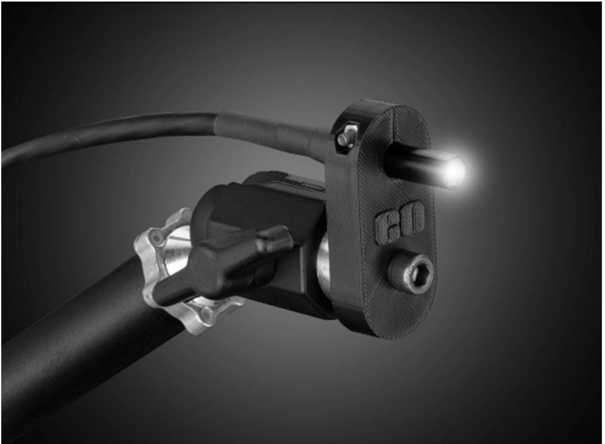
Spot Light Configuration