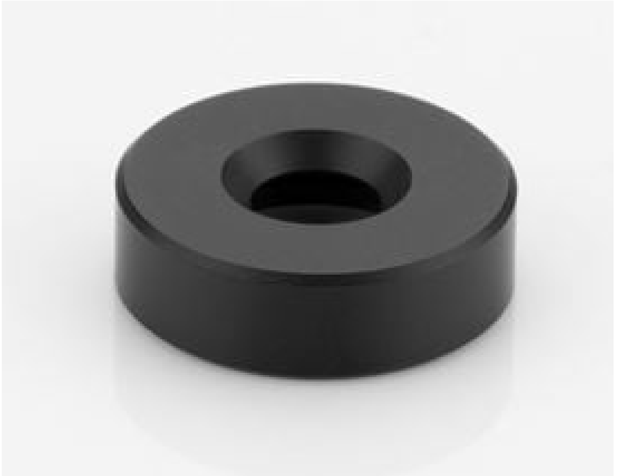
Filter Holder for 50mm Cx Lens (representative photo). Filter Holder varies by stock number. View PDF drawing for additional information.