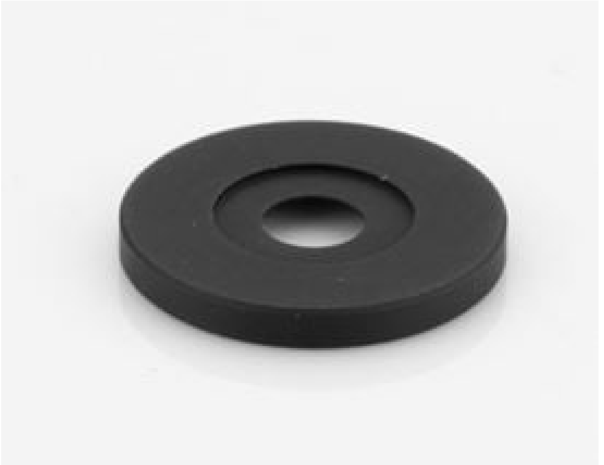
Aperture for Cx Lens (representative photo). Aperture varies by stock number. View PDF drawing for additional information.