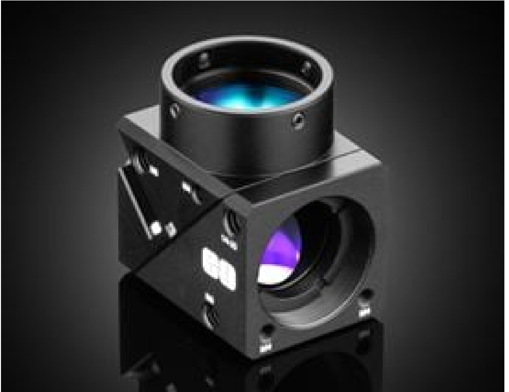
#18-508: Filter Cube Assembly