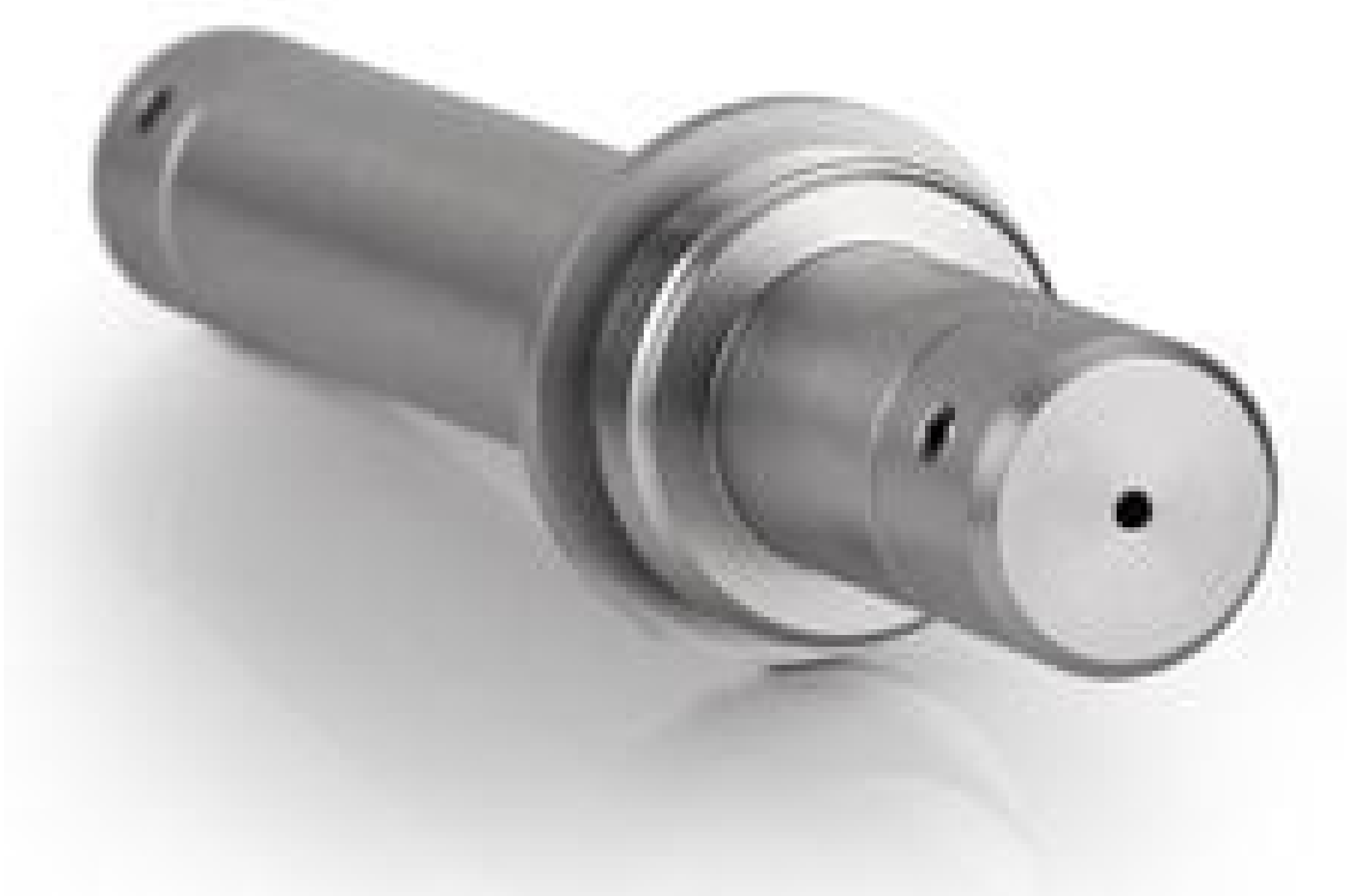
Flat Top Beam Shaper Aligner, #34-313