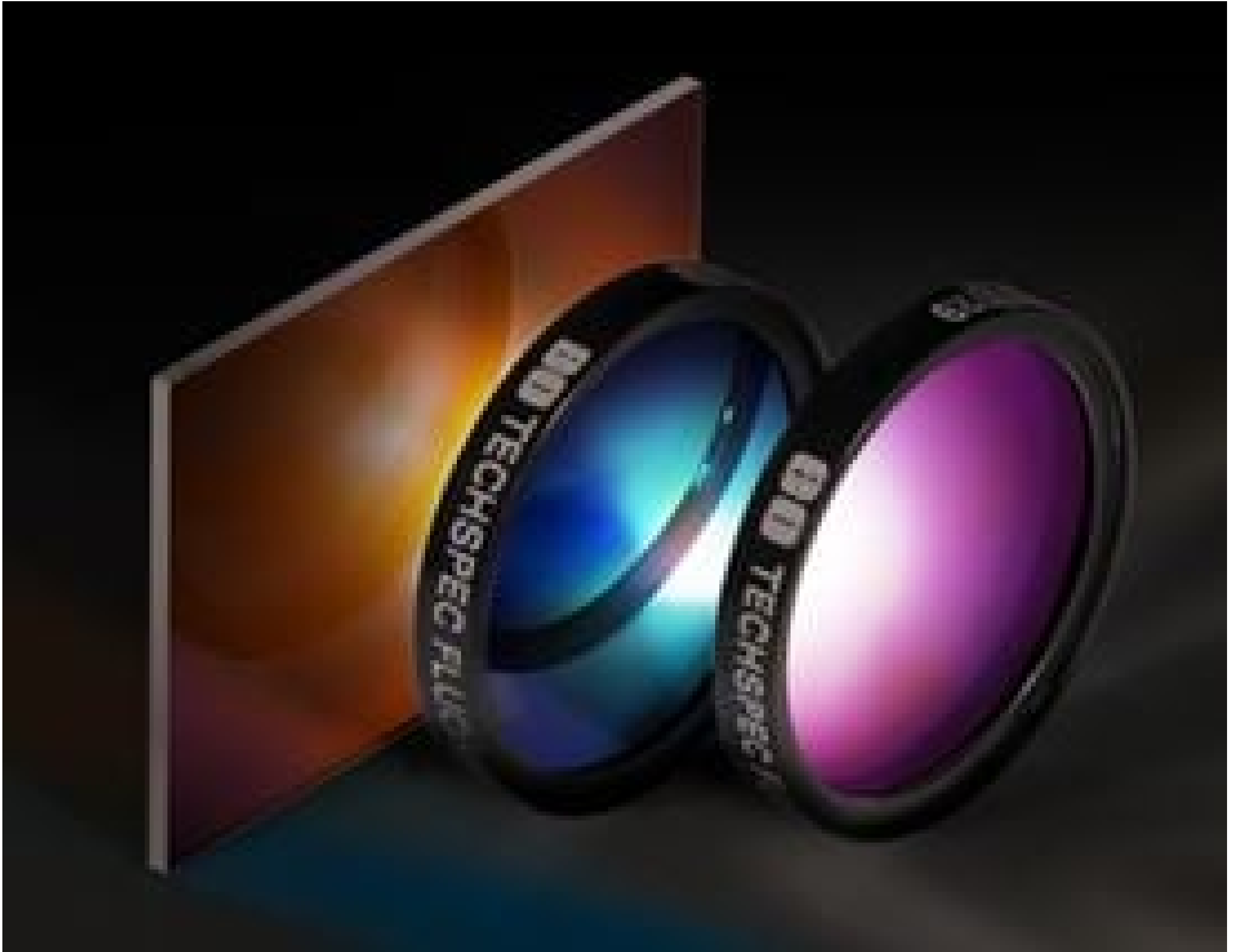
Fluorescence Filter Sets