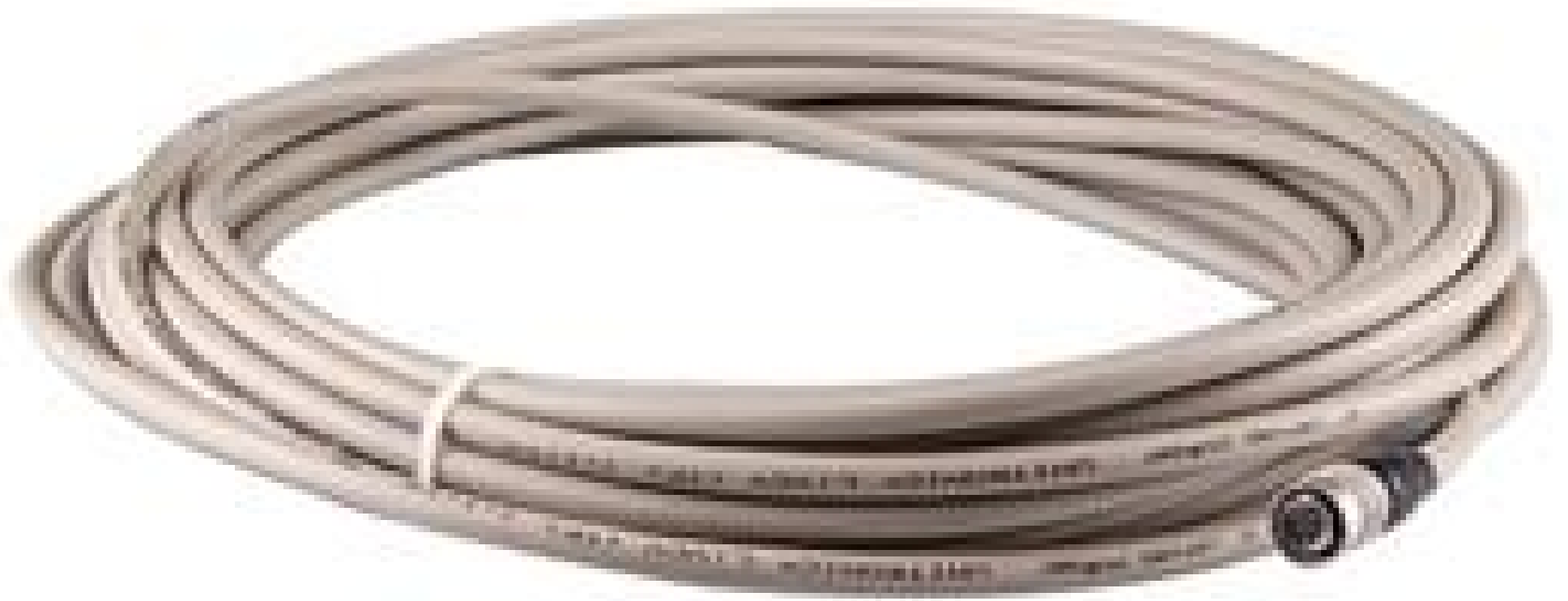
10m GPIO & Power Cable, #88-516