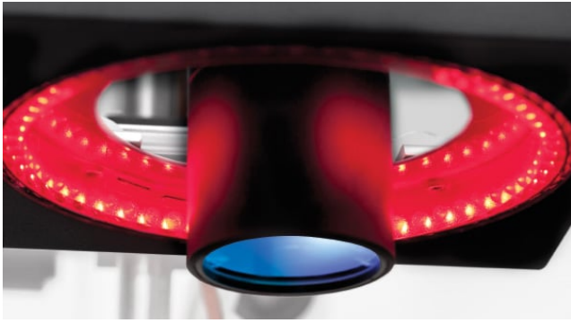
Hypercentric Lens in Borescope Mode