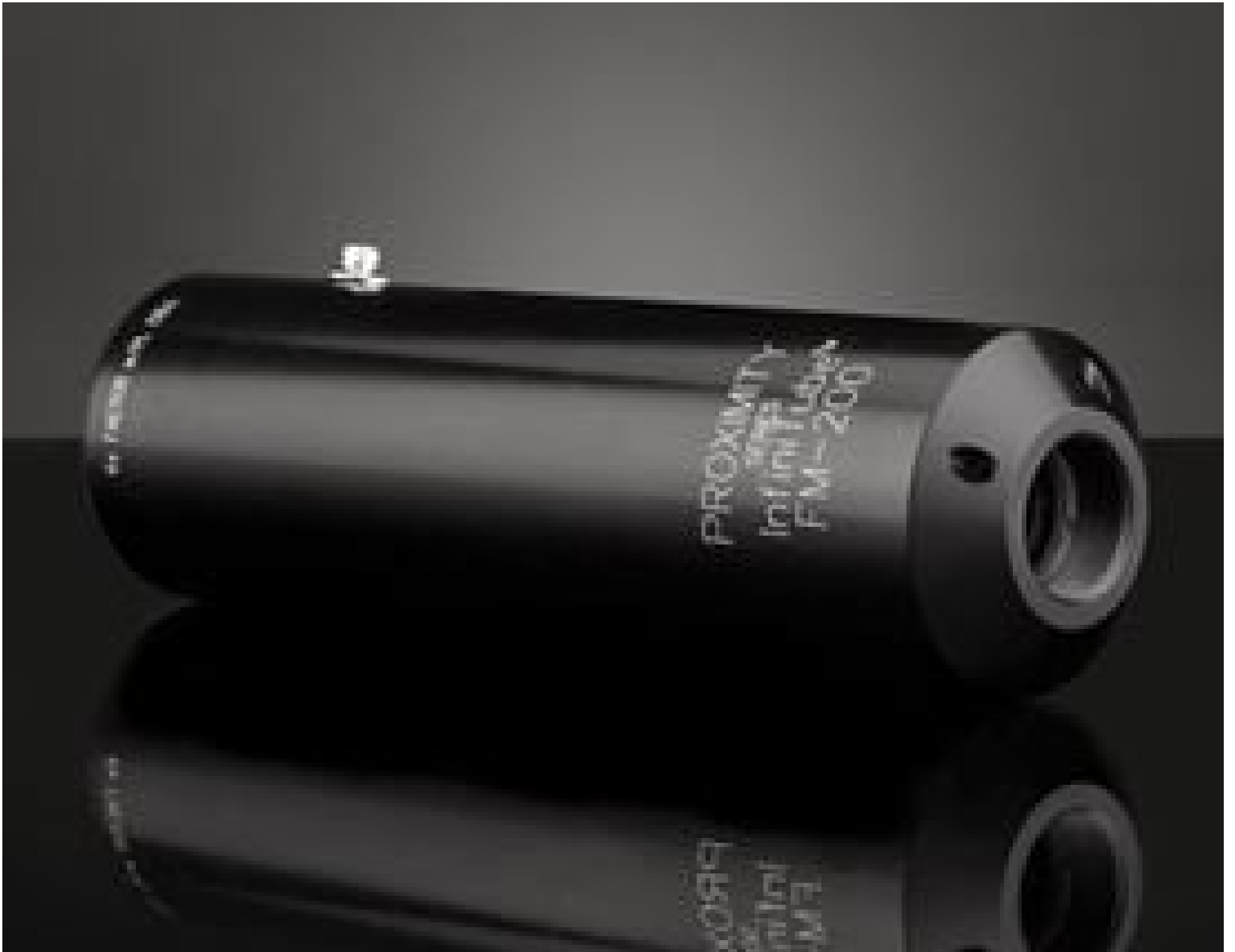
InfiniTube FM-200 (1X), #58-310

See More by Infinity Photo-Optical Company