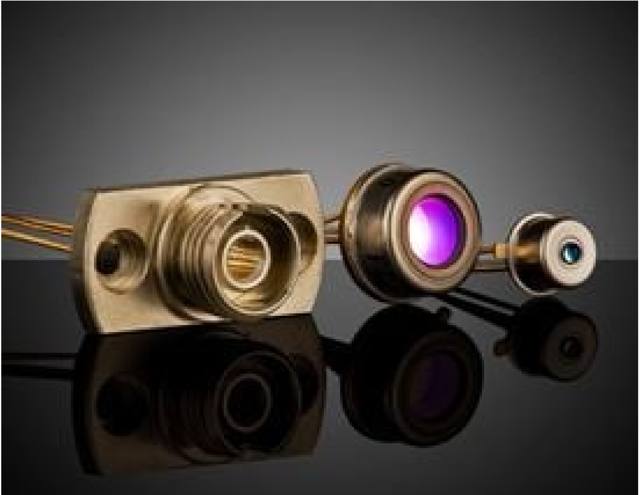
InGaAs Photodiodes (FC Receptacle , TO-5, TO-46)