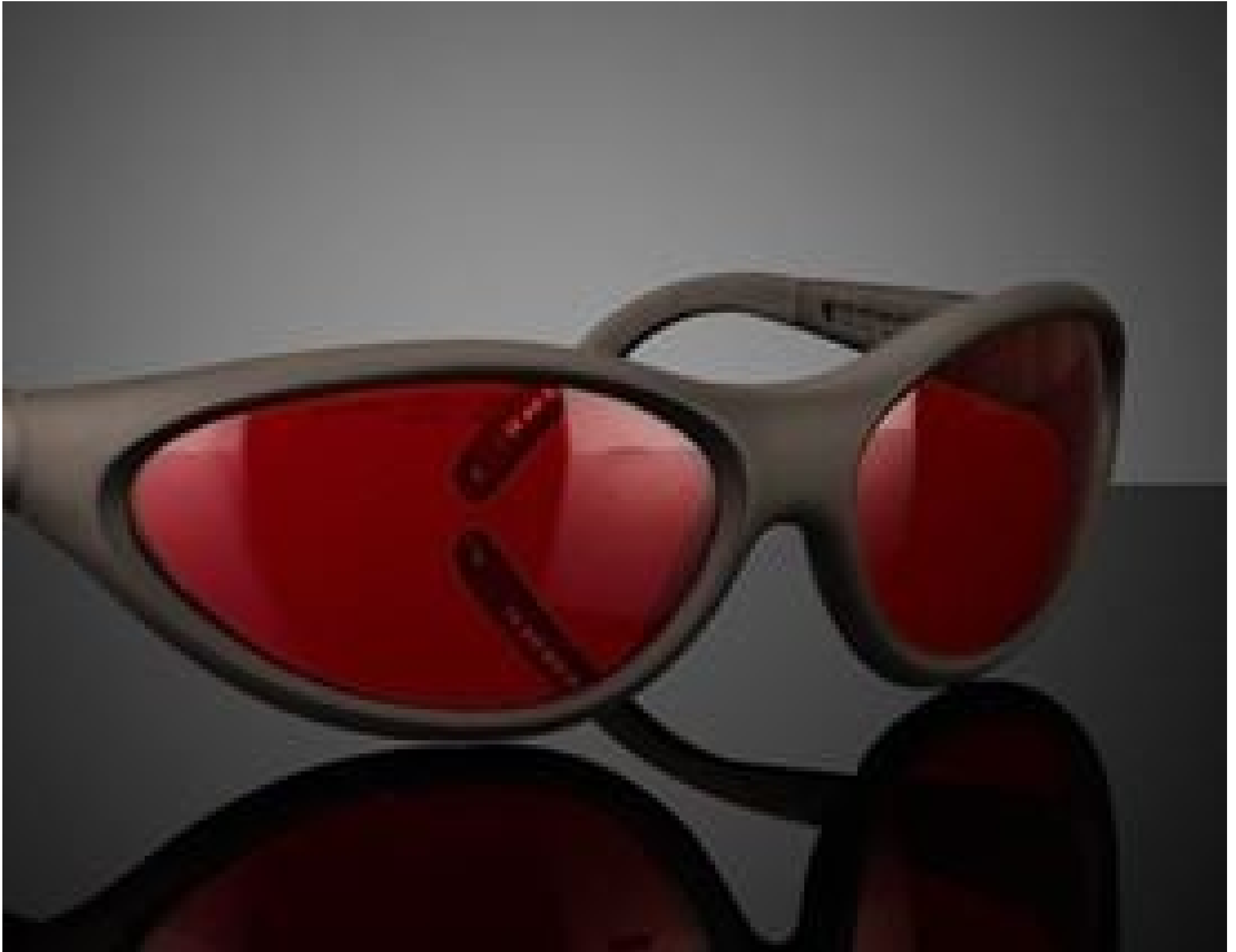
Image represents frame style only. Filter color will vary by product specification.