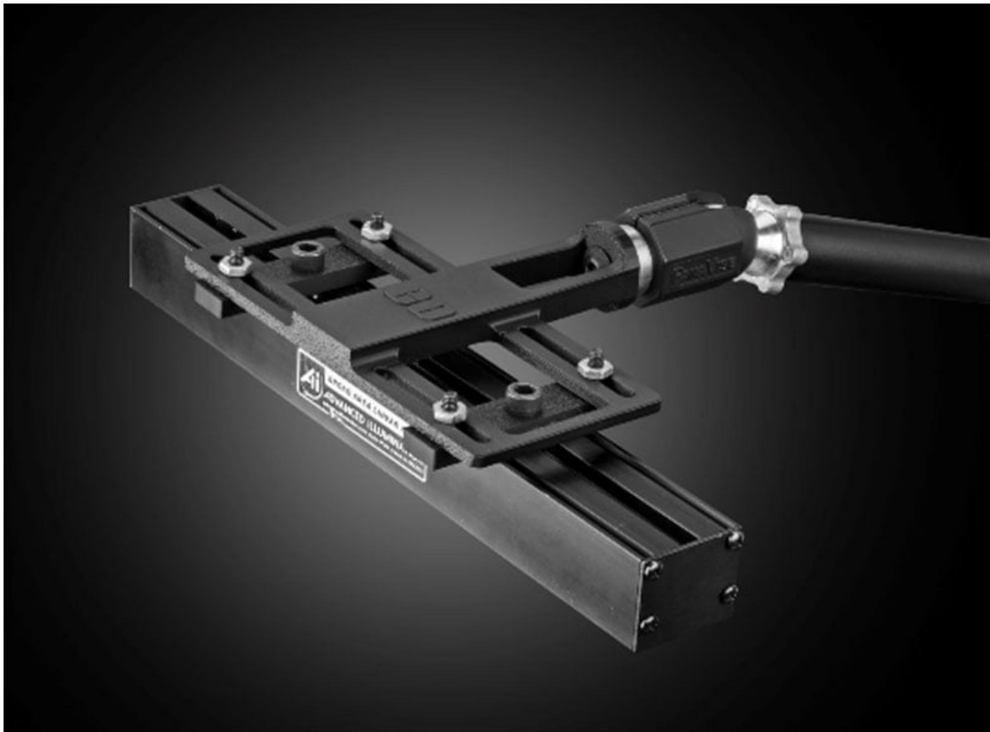
Bar or Line Light Configuration