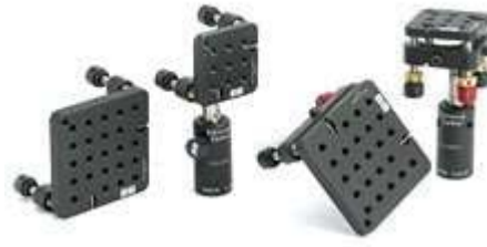
Kinematic Table Platforms