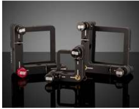
Kinematic Square Optical Mounts