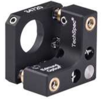
Compact Kinematic Mounts