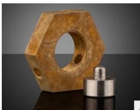
#58-883: Locking Nut and Step Adapter