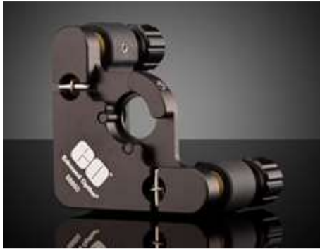
Kinematic Optical Mirror Mounts