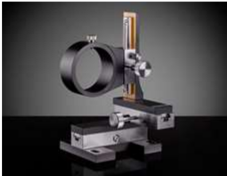
#03-607 - 50mm Diameter, X-Y-Z Positioning Movement A$1,560.00