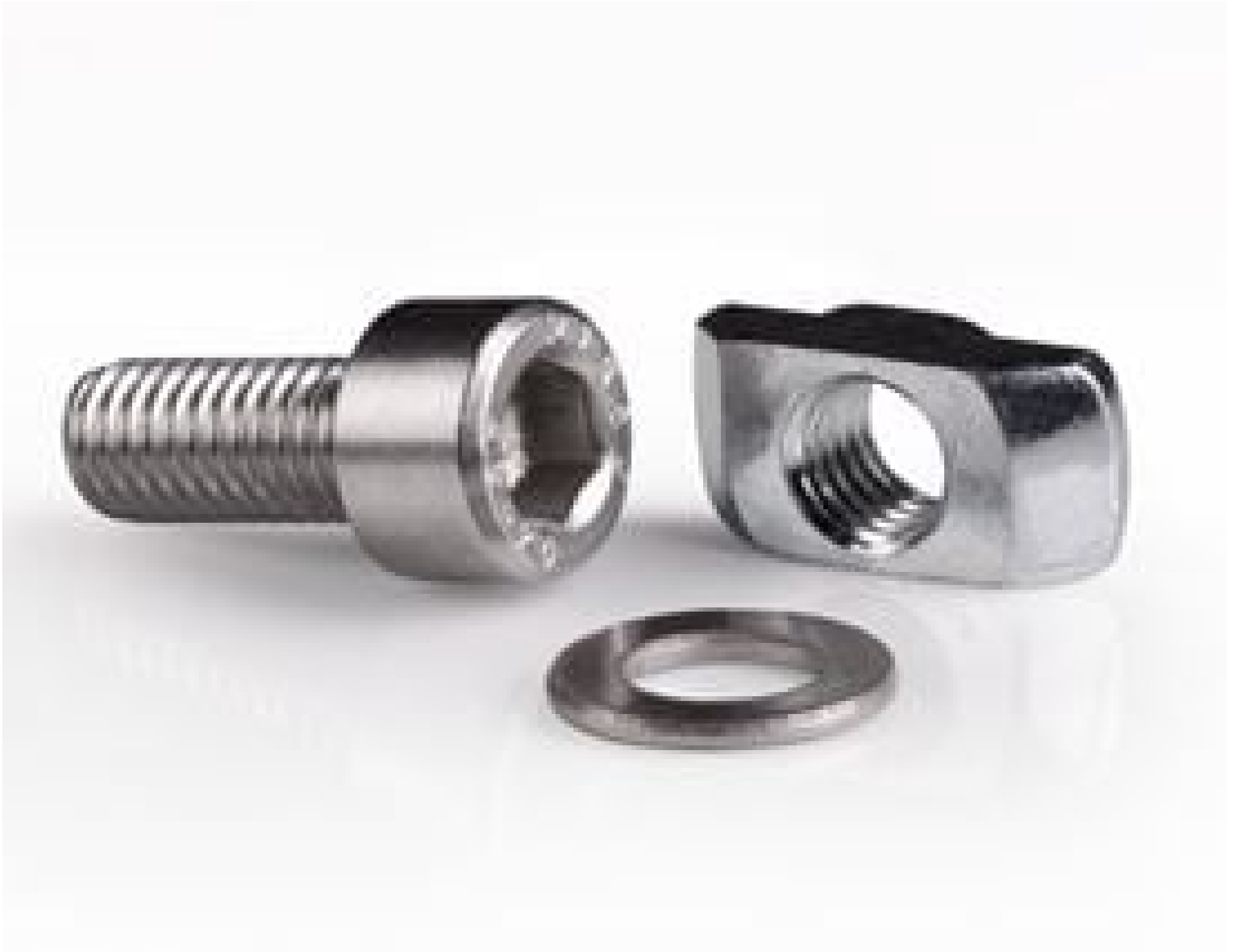
M6 T-Nut (includes M6 x 14 screw), #34-888