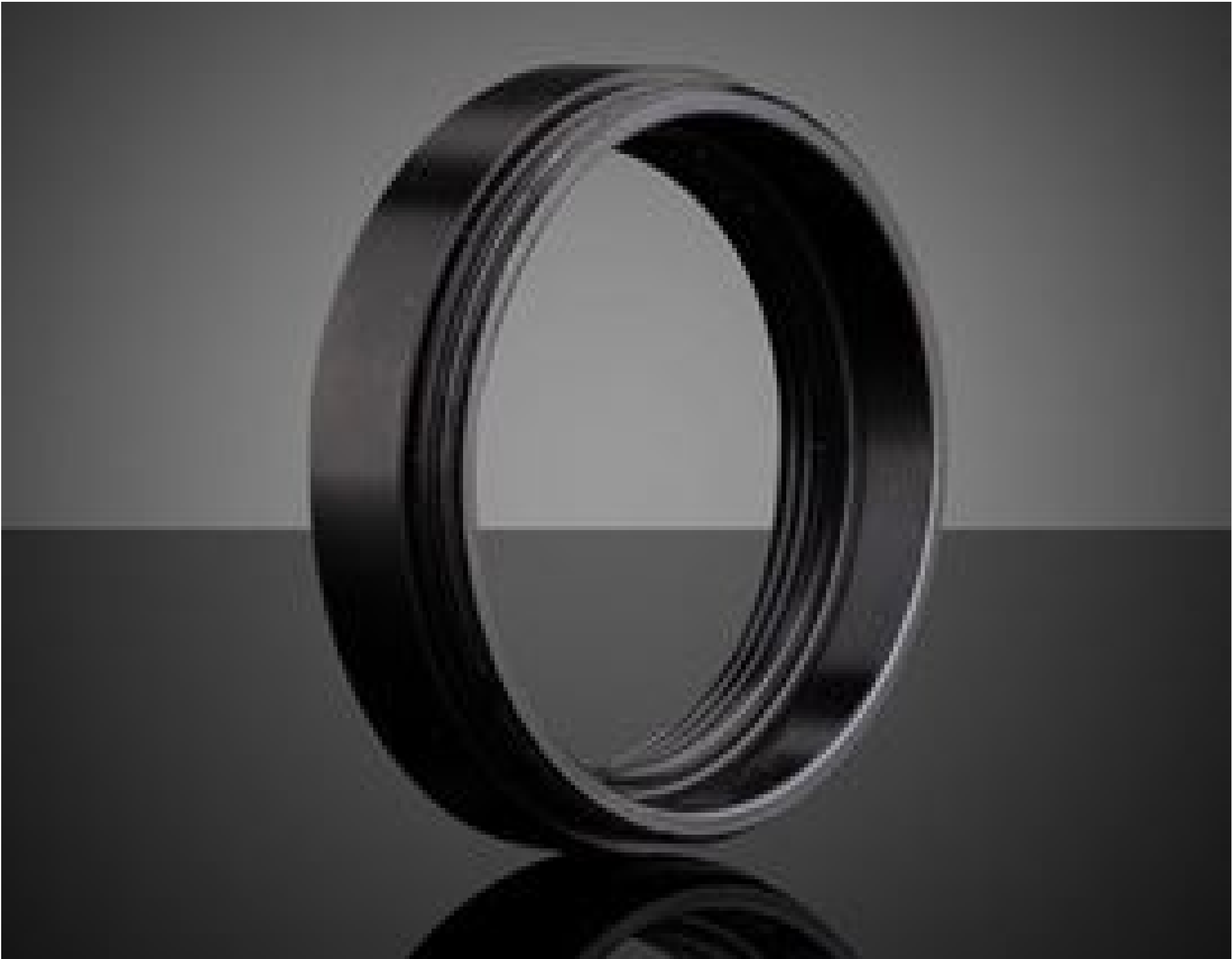
#33-429: Male M30.5 to Female C-Mount