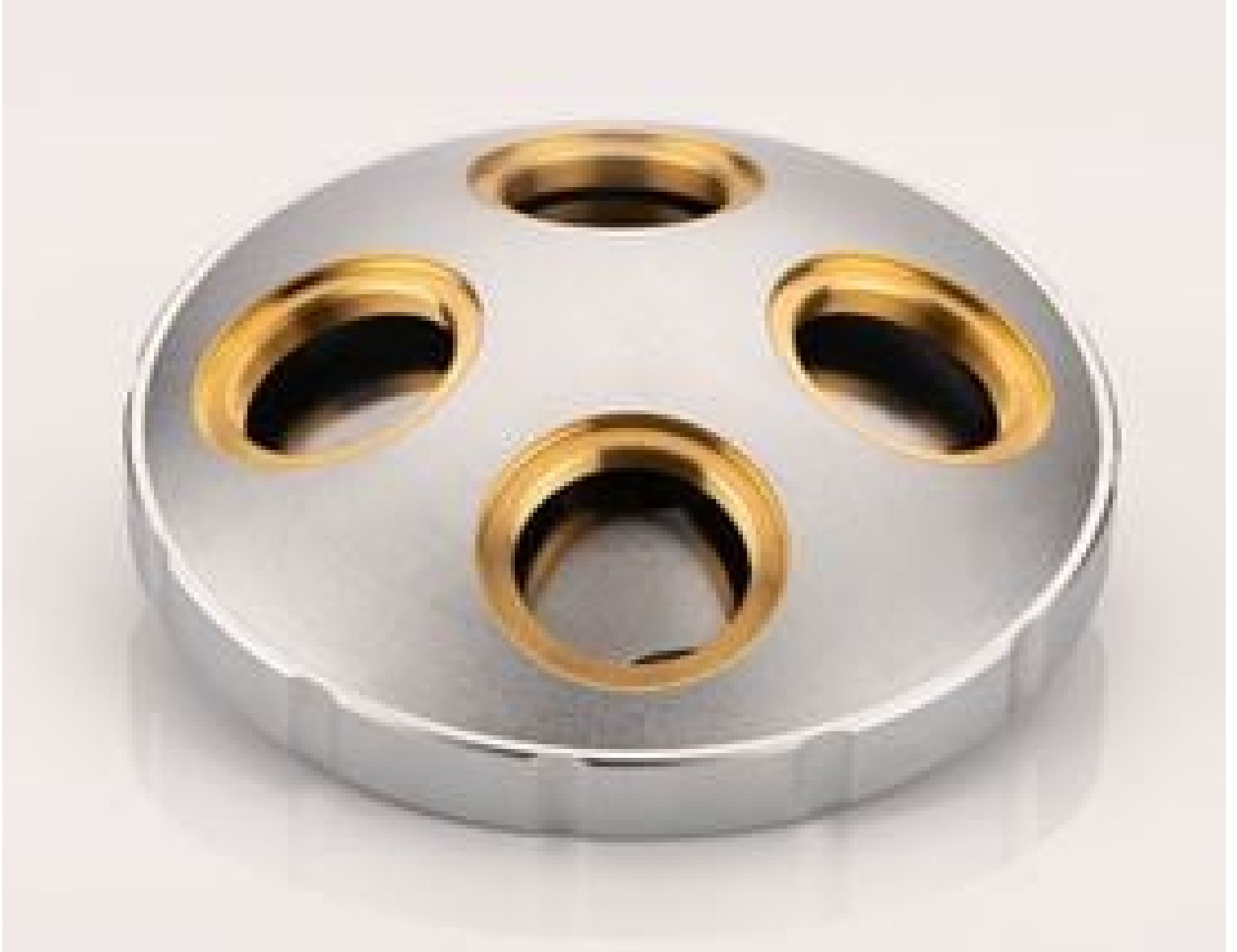
Manual Turret for Mitutoyo Widefield Video Microscope Unit