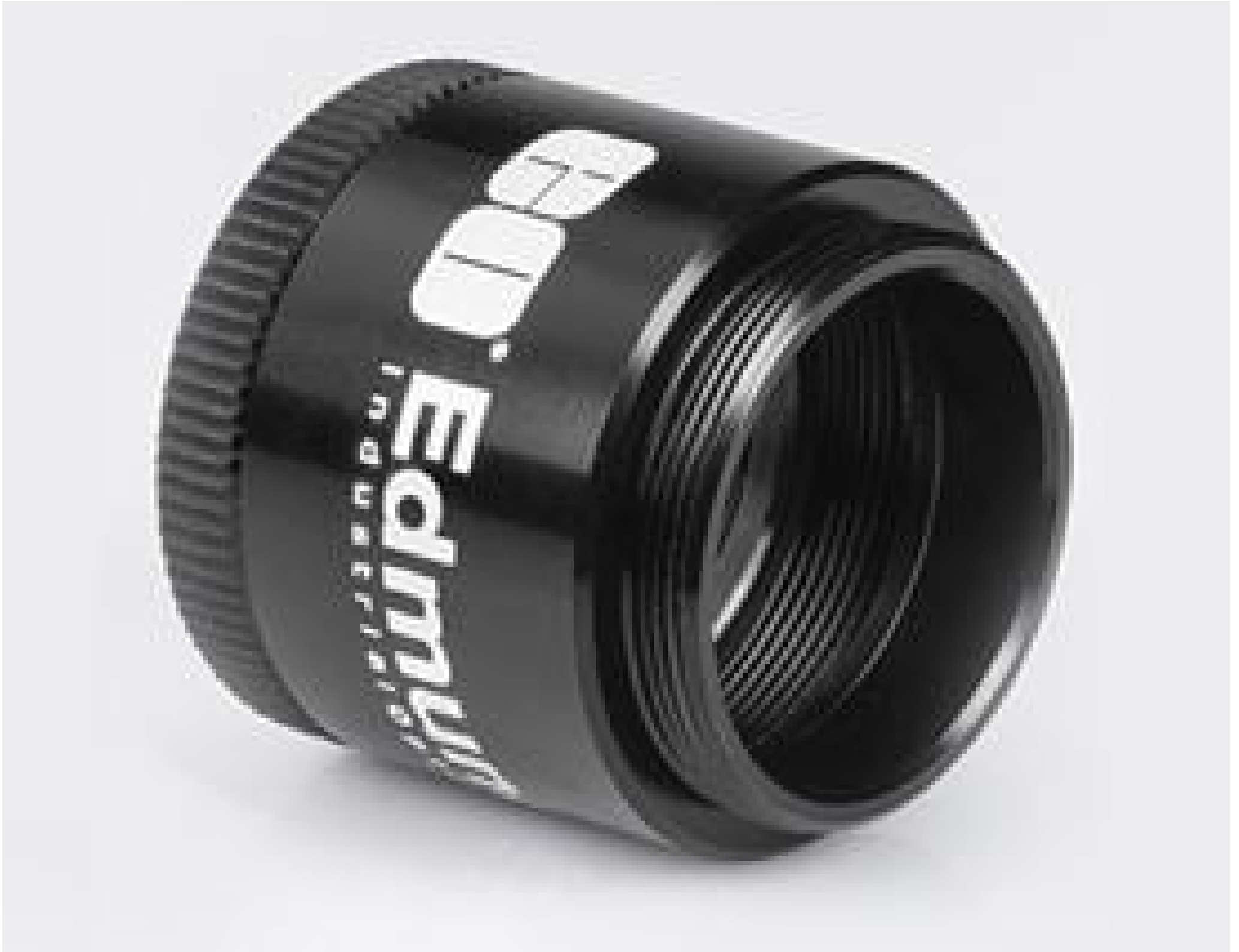
Mitutoyo Filter Holder, #56-993