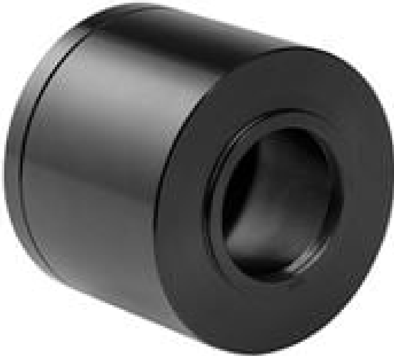
Mitutoyo MT-L/MT-L4 C-Mount Adapter, #66-027